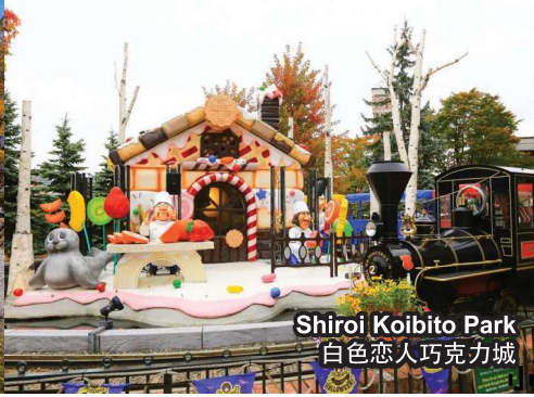
Shiroyo Koibito Park 白色恋人巧克力城