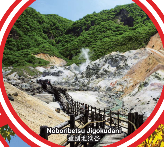
Noboribetsu Jigokudani 登别地狱谷