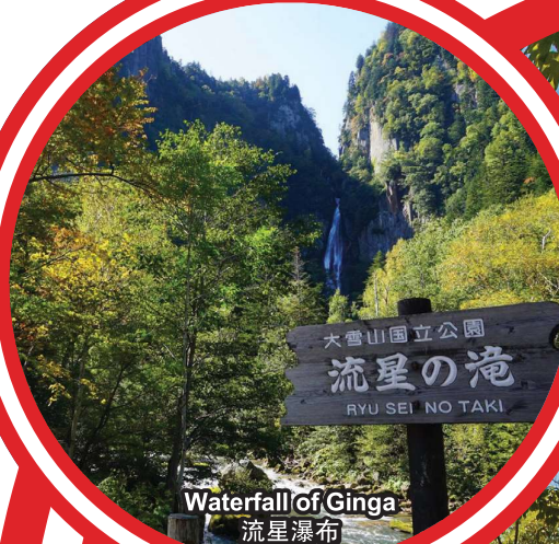
Waterfall of Ginga 流星瀑布