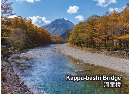
Kappa-bashi Bridge 河童桥