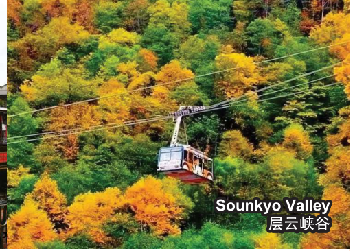
Sounkyo Valley 层云峡谷