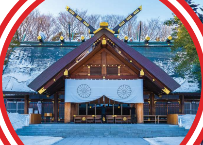
Hokkaido Shrine 北海道神宫