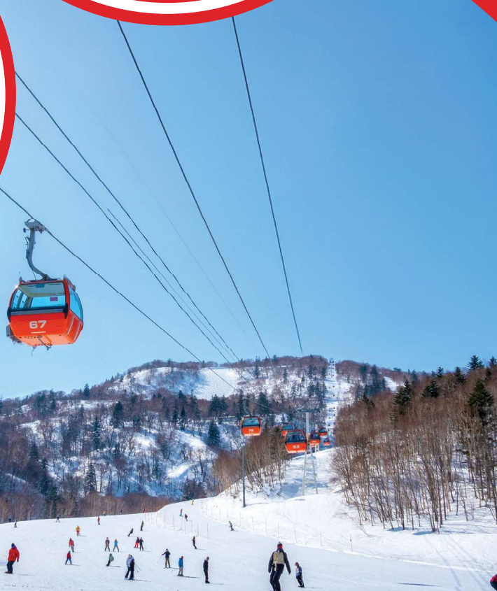
Sapporo Kokusai Ski 札幌国际滑雪场

行程次序，以當地旅社安排為準。 Sequences of Itinerary are subject to local arrangement.