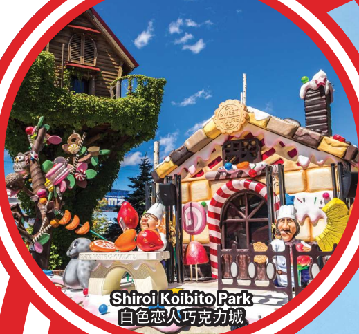
Shiroyo Koibito Park 白色恋人巧克力城