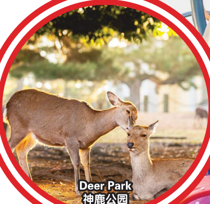
Deer Park 神鹿公园