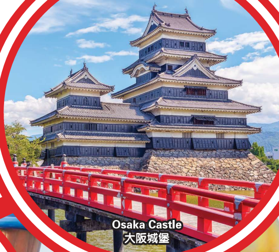
Osaka Castle 大阪城堡