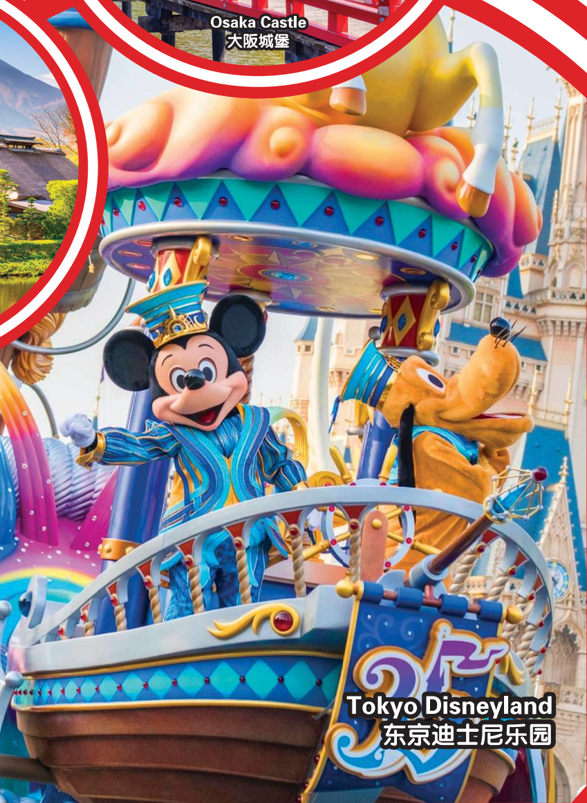
Tokyo Disneyland 东京迪士尼乐园

行程次序，以當地旅社安排為準。 Sequences of Itinerary are subject to local arrangement.