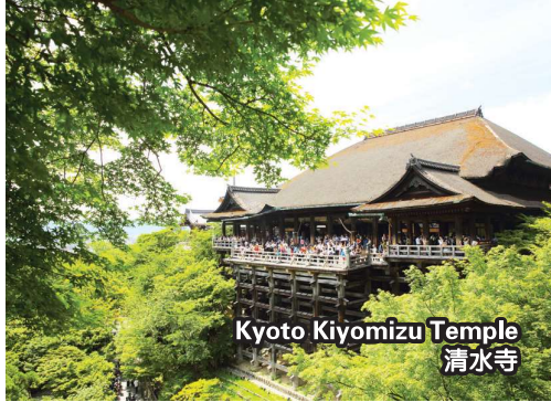
Kyoto Kiyomizu Temple 清水寺