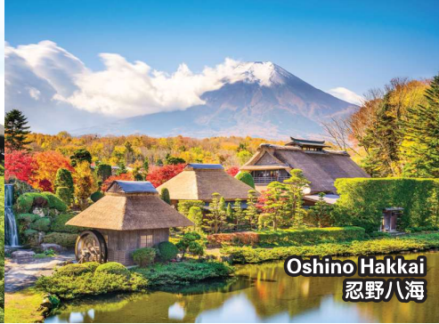
Oshino Hakkai 忍野八海