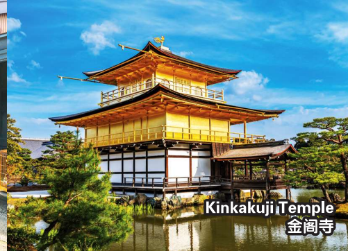
Kinkakuji Temple 金閣寺