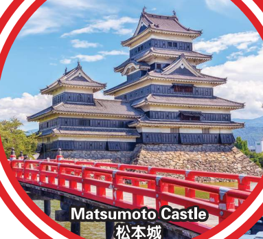
Matsumoto Castle 松本城