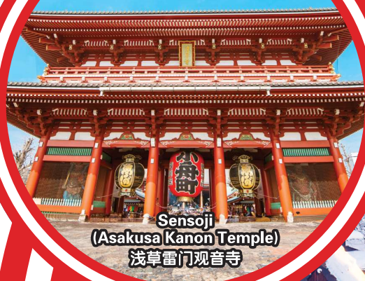
Sensoji (Asakusa Kanon Temple) 浅草雷门观音寺