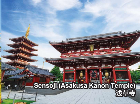
Sensoji (Asakusa Kanon Temple) 浅草寺