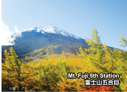
Mt. Fuji 5th Station 富士山五合目