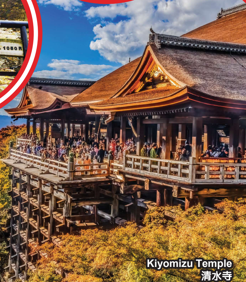
Kiyomizu Temple 清水寺

行程次序，以当地旅社安排为准。 Sequences of Itinerary are subject to local arrangement.