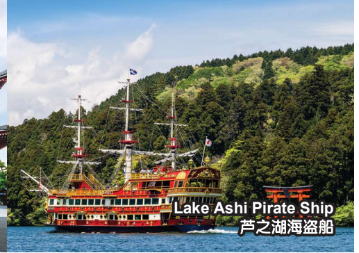
Lake Ashi Pirate Ship 芦之湖海盜船