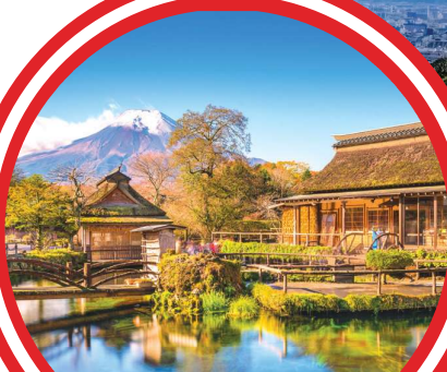
Oshino Hakkai 忍野八海