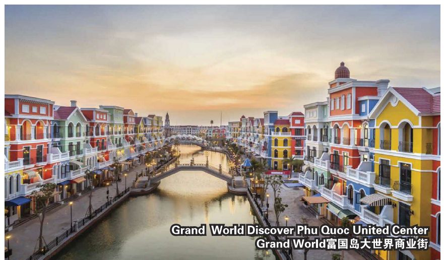
Grand World Discover Phu Quoc United Center Grand World 富国岛大世界商业街

✓ Wyndham Garden Grandworld or similar class x3 Nights