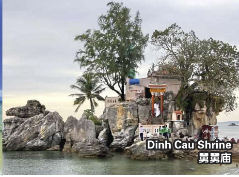
Dinh Cau Shrine 舅舅庙