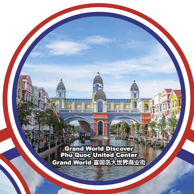
Grand World Discover Phu Quoc United Center Grand World 富国岛大世界商业街