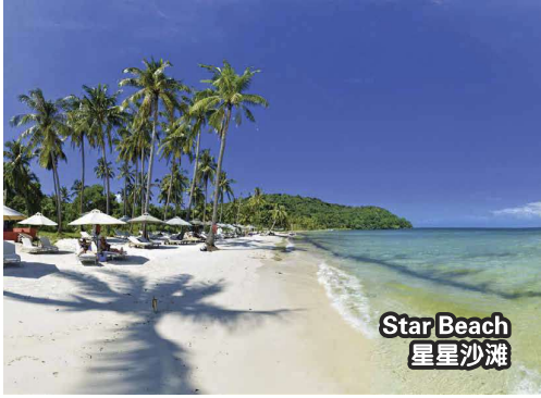
Star Beach 星星沙滩