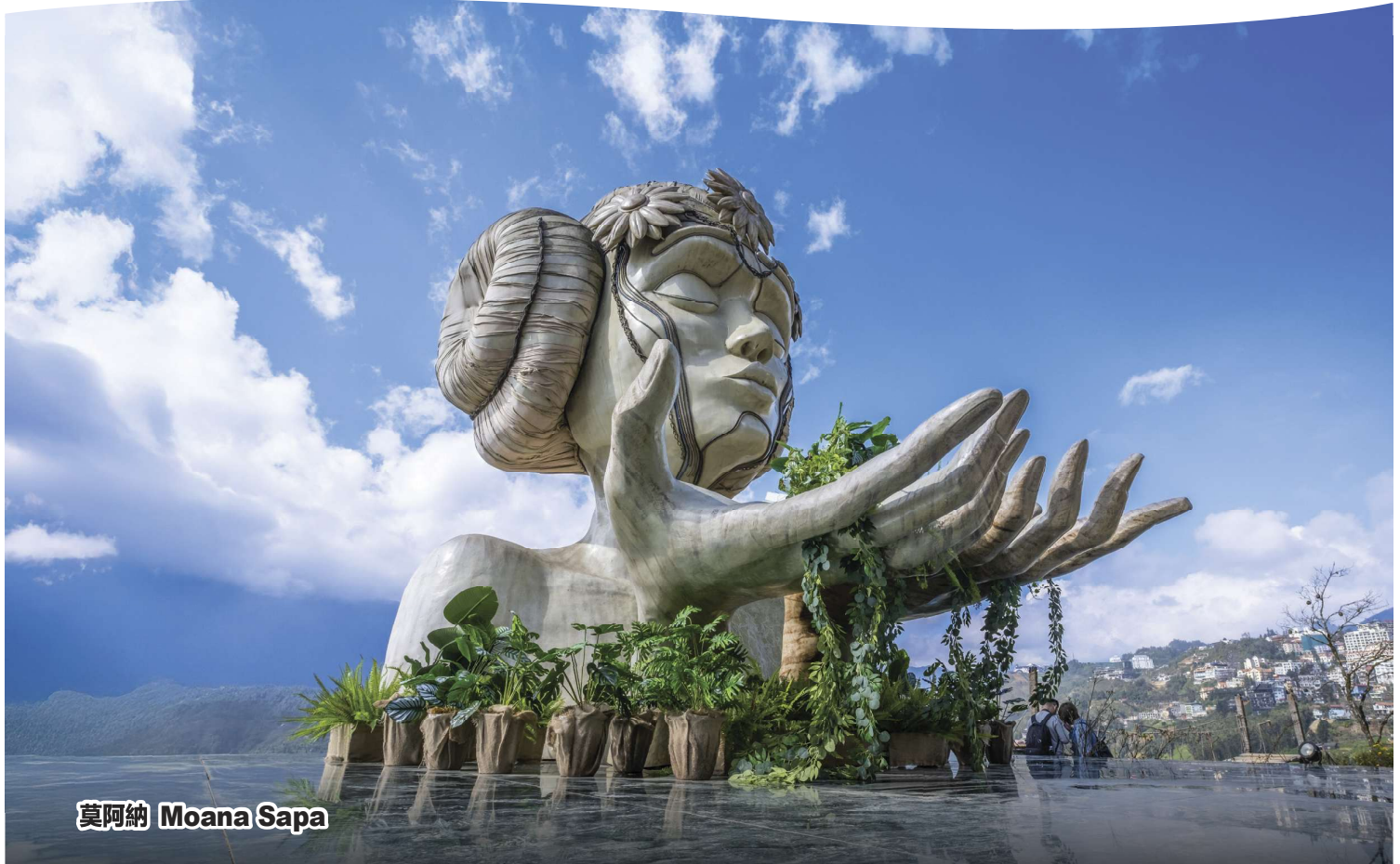
莫阿纳 Moana Sapa