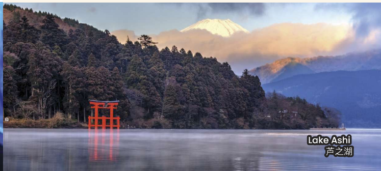
Lake Ashi 芦之湖