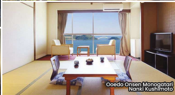
Ooedo Onsen Monogatari Nanki Kushimoto