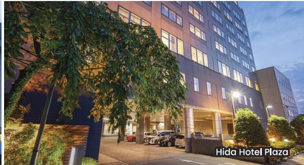
Hida Hotel Plaza