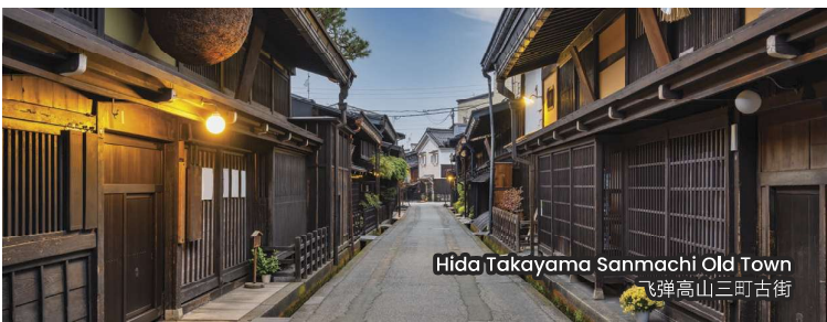
Hida Takayama Sanmachi Old Town 飛騨高山三町古街