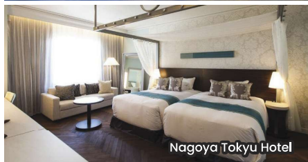
Nagoya Tokyu Hotel