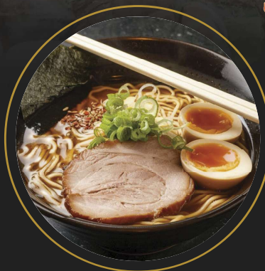
World Famous Ramen 世界著名拉面