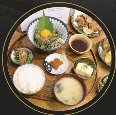
Rustic Japanese Set 日本乡村风味