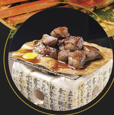
Miso Yaki 香叶味噌烧