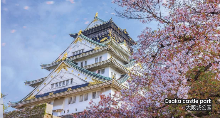
Osaka castle park 大阪城公園