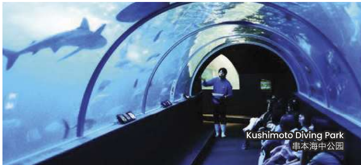
Kushimoto Diving Park 串本海中公园

行程次序以当地旅行社安排为准。行程，膳食，住宿，交通等可能会因不可抗拒因素而更动，恕不另行通知。