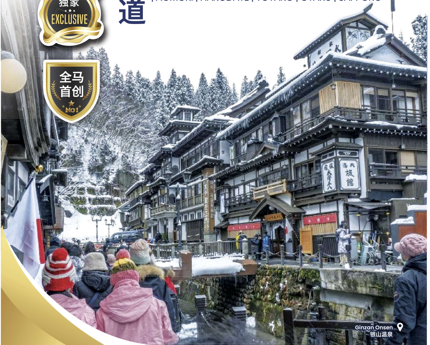
Ginzan Onsen 银山温泉