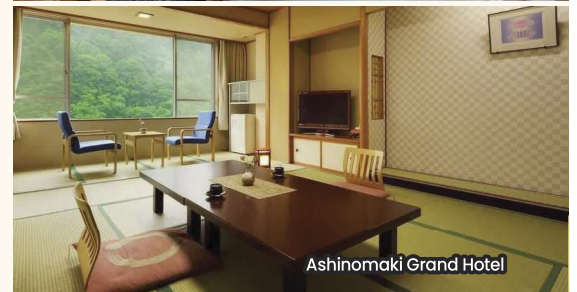
Ashinomaki Grand Hotel