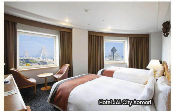
Hotel JAL City Aomori