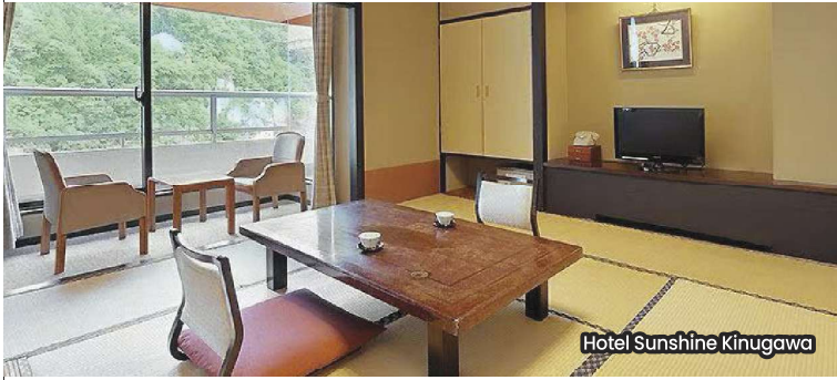
Hotel Sunshine Kinugawa