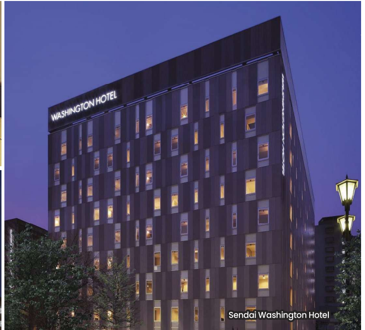
Sendai Washington Hotel