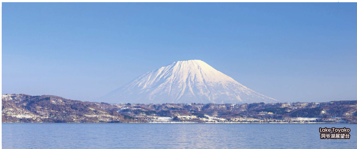
Lake Toyako 洞爷湖展望台