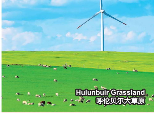
Hulunbuir Grassland 呼伦贝尔大草原