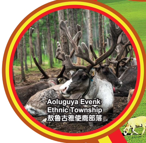
Aoluguya Evenk Ethnic Township 敖鲁古雅使鹿部落