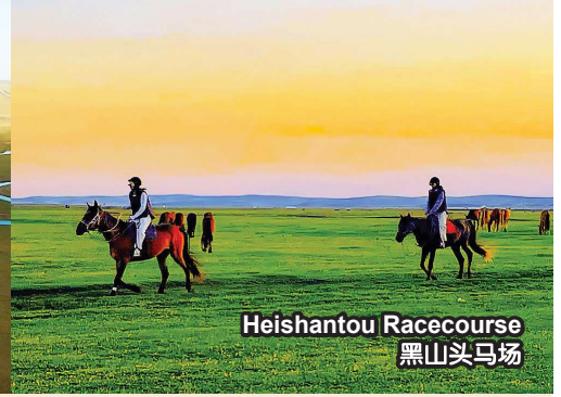
Heishantou Racecourse 黑山头马场