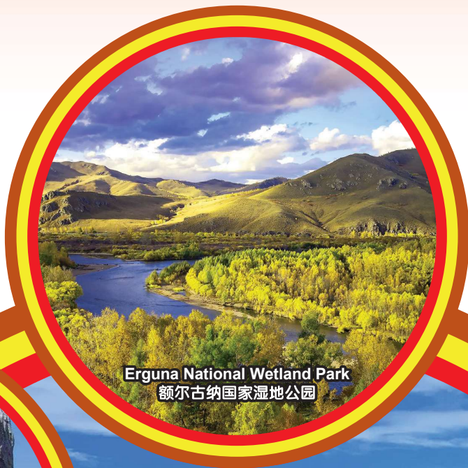
Erguna National Wetland Park 额尔古纳国家湿地公园