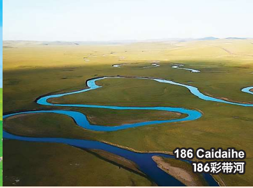
186 Caidaihe 186彩带河