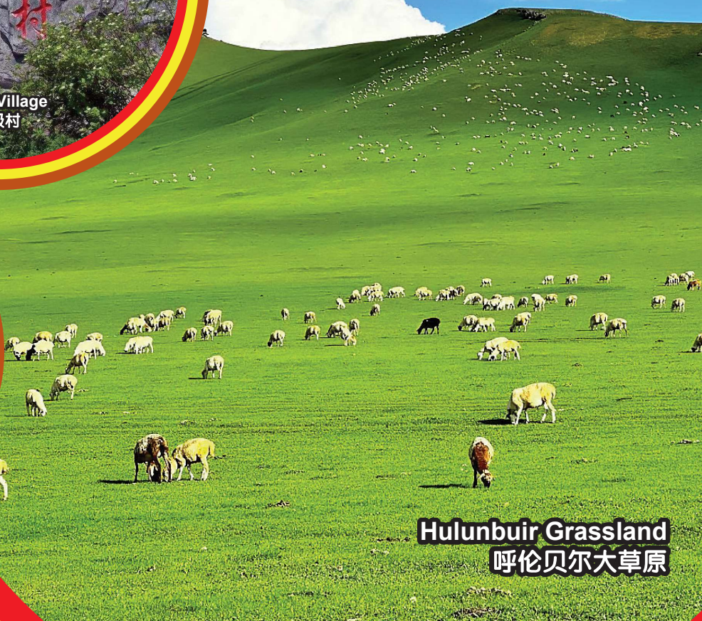
Hulunbuir Grassland 呼伦贝尔大草原

行程次序，以当地旅社安排为准。 Sequences of Itinerary are subject to local arrangement.