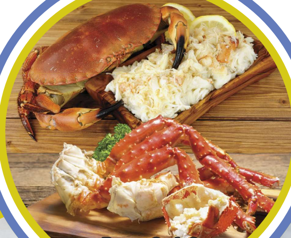
Brown Crab & King Crab