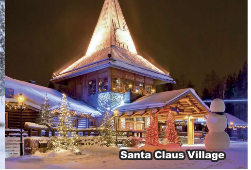
Santa Claus Village