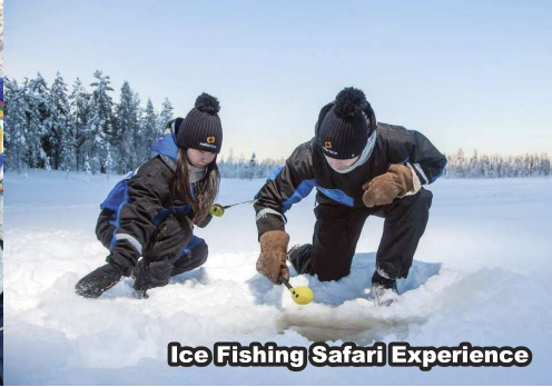
Ice Fishing Safari Experience