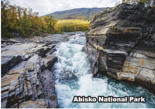
Abisko National Park