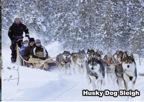
Husky Dog Sleigh