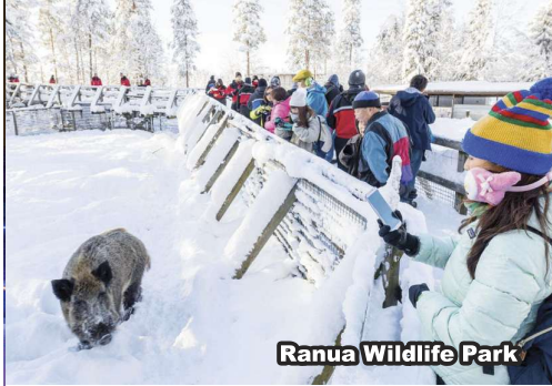
Ranua Wildlife Park