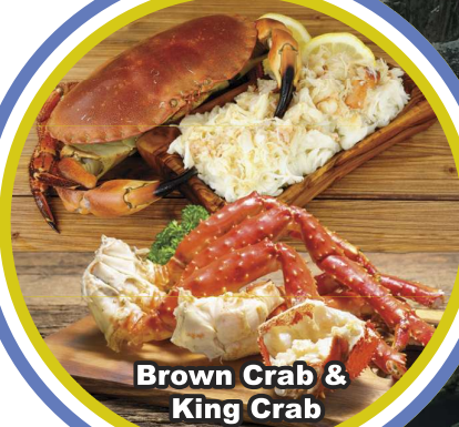
Brown Crab & King Crab