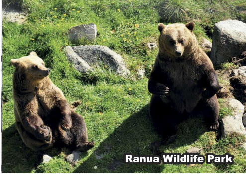
Ranua Wildlife Park