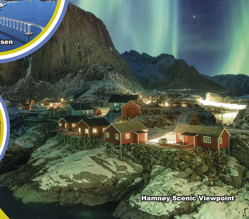
Hamnøy Scenic Viewpoint