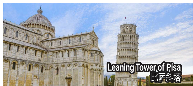
Leaning Tower of Pisa 比萨斜塔