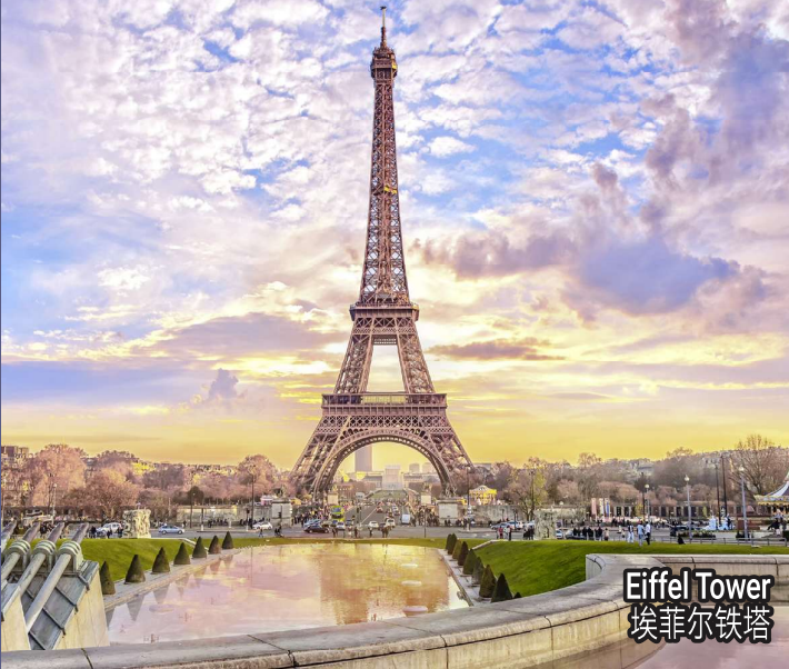
Eiffel Tower 埃菲尔铁塔