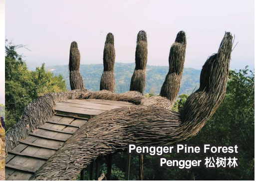
Pengger Pine Forest Pengger 松树林