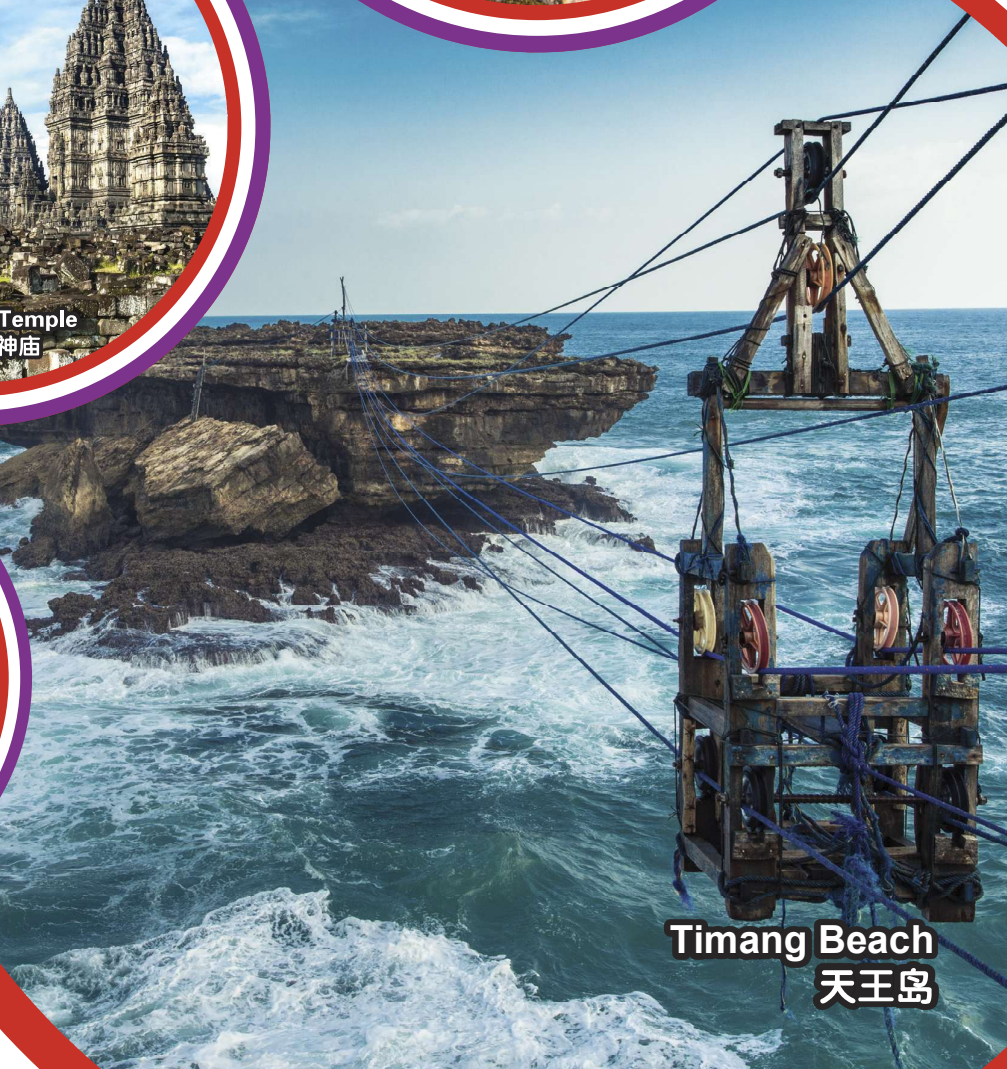
Timang Beach 天王岛

行程次序，以当地旅社安排为准。 Sequences of Itinerary are subject to local arrangement.