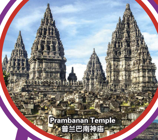
Prambanan Temple 普兰巴南神庙