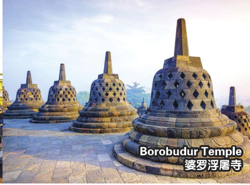
Borobudur Temple 婆罗浮屠寺