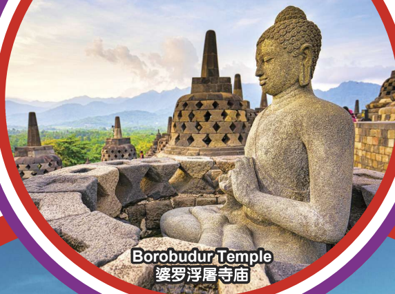
Borobudur Temple 婆罗浮屠寺庙