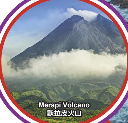
Merapi Volcano 默拉皮火山