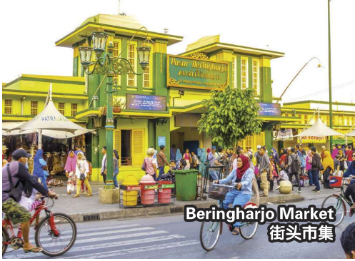
Beringharjo Market 街头市集