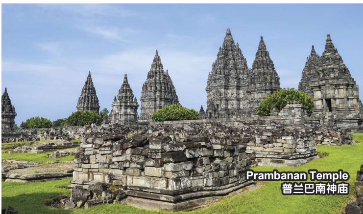
Prambanan Temple 普兰巴南神庙

✓ Crystal Lotus Hotel or similar class x3 Nights