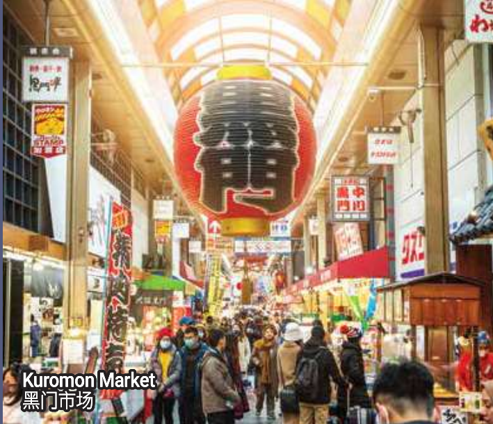
Kuromon Market 黑门市场