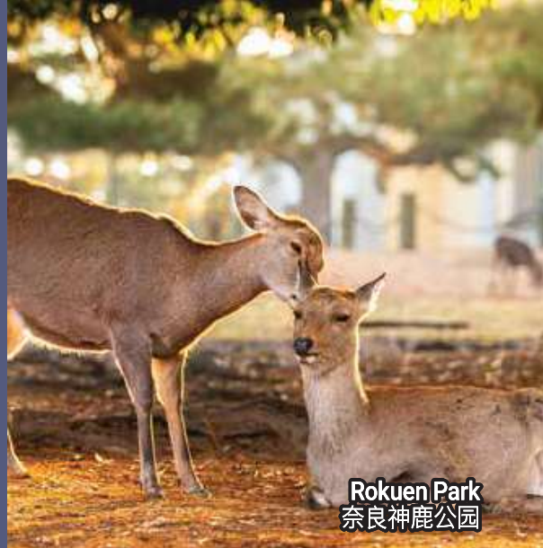
Rokuen Park 奈良神鹿公园