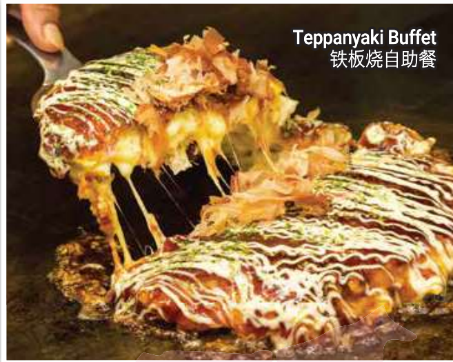
Teppanyaki Buffet 铁板烧自助餐

Deluxe abalone, lobster, scallops, prawns (Japanese pork, beef and chicken all-you-can-eat!) 豪华鲍鱼, 龙虾, 带子, 明虾 (日本豚、牛、鸡肉吃到饱!)