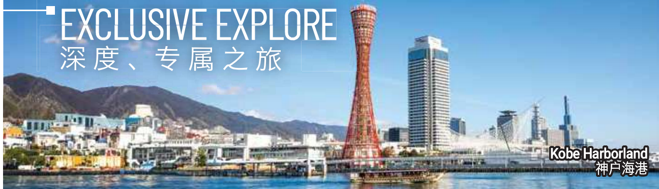
Kobe Harborland 神戸海港