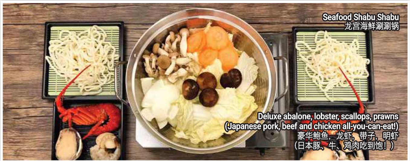
Seafood Shabu Shabu 龙宫海鲜涮涮锅

Deluxe abalone, lobster, scallops, prawns (Japanese pork, beef and chicken all-you-can-eat!) 豪华鲍鱼, 龙虾, 带子, 明虾 (日本豚、牛、鸡肉吃到饱!)