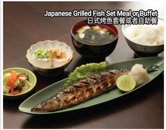
Japanese Grilled Fish Set Meal or Buffet 日式烤鱼套餐或者自助餐