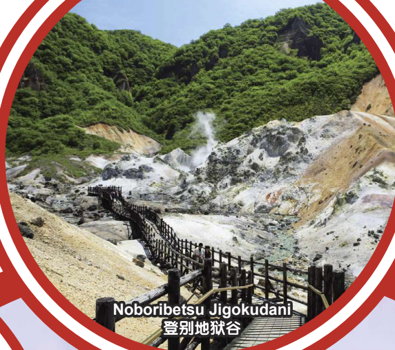
Noboribetsu Jigokudani 登别地狱谷