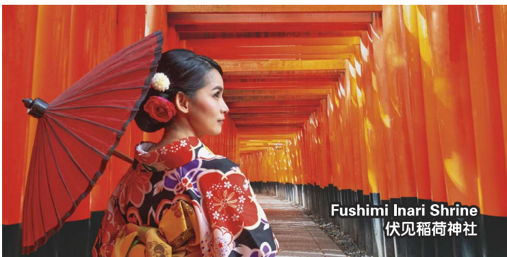
Fushimi Inari Shrine 伏见稻荷神社