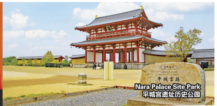
Nara Palace Site Park 平城宫遗址历史公园

Disclaimer: Golden Destinations reserved the right to alter the sequence or change, amend or alter the itinerary if necessary, with or without prior notice. Remark: There will be no refund or replacement if the tour logistic affected by the above issue. All pictures are for illustration purpose only.