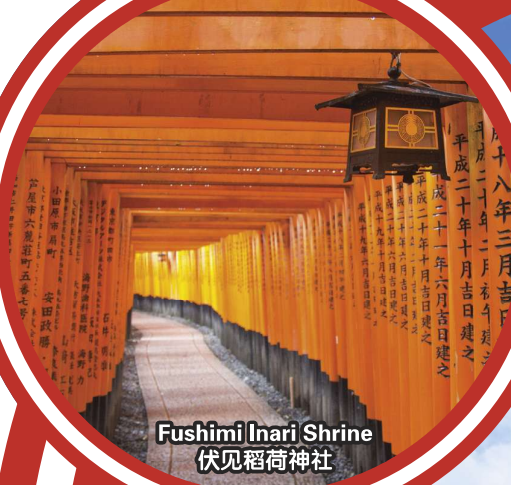
Fushimi Inari Shrine 伏见稻荷神社