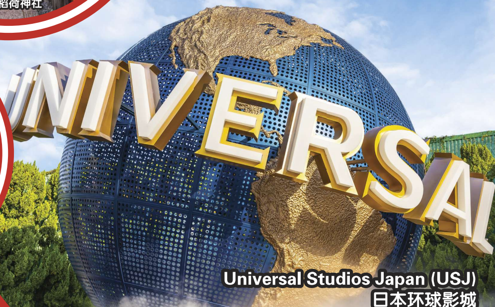
Universal Studios Japan (USJ) 日本环球影城