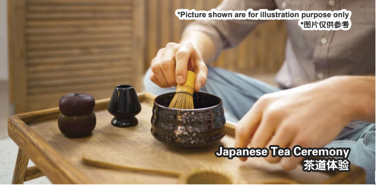
Japanese Tea Ceremony 茶道体验

*Picture shown are for illustration purpose only *图片仅供参考