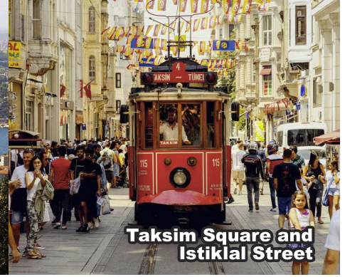
Taksim Square and Istiklal Street