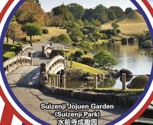
Suizenji Jojuen Garden (Suizenji Park) 水前寺成趣园