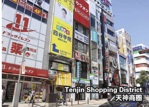
Tenjin Shopping District 天神商圏