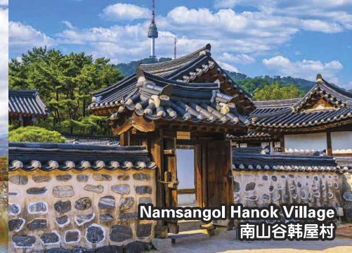
Namsangol Hanok Village 南山谷韩屋村