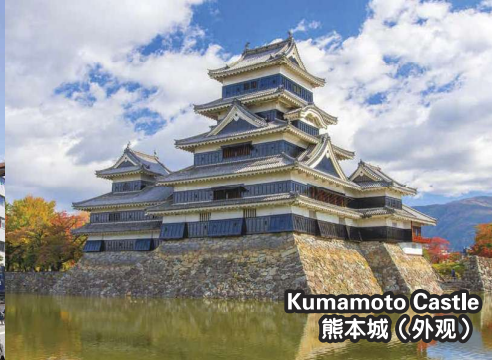
Kumamoto Castle 熊本城 (外观)