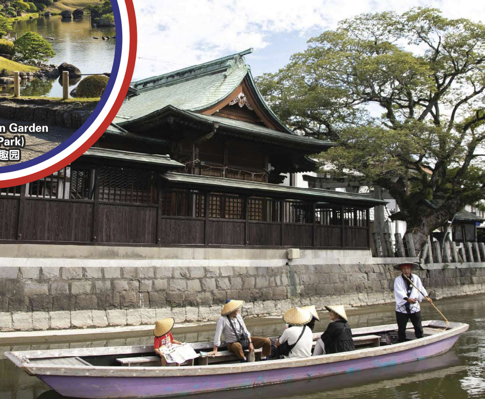
Yanagawa River Boat Ride 沿柳川运河乘船

行程次序，以当地旅社安排为准。 Sequences of Itinerary are subject to local arrangement.