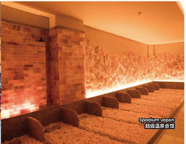
Spadium Japon 超级温泉会馆