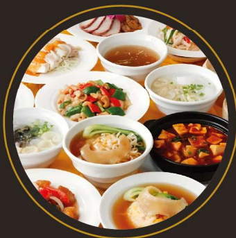
Yokohama Chinatown Buffet 横滨中华街自助餐