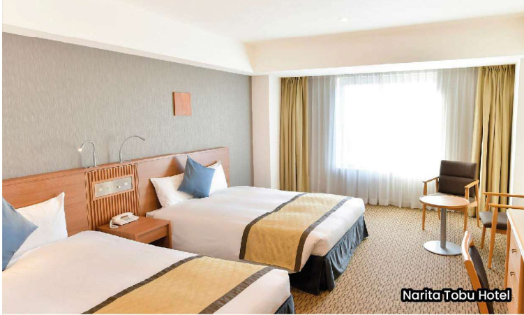
Narita Tobu Hotel