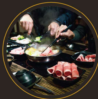
Kurobuta Hot Pot 日本黑毛猪火锅