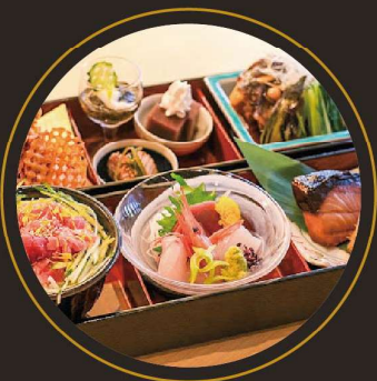
Matsuhana Course 松花御膳