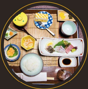
Onsen Kaiseki Ryori 温泉怀石料理