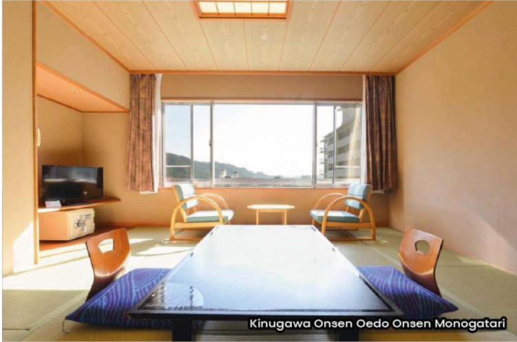
Kinugawa Onsen Oedo Onsen Monogatari