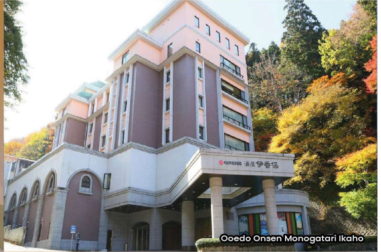
Oedo Onsen Monogatari Ikaho