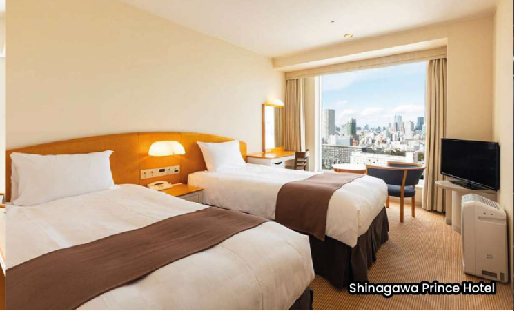
Shinagawa Prince Hotel