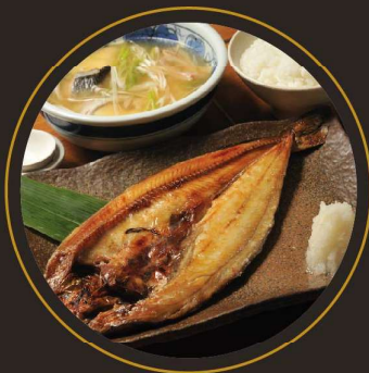
Grilled Fish Teishoku 烤鱼定食