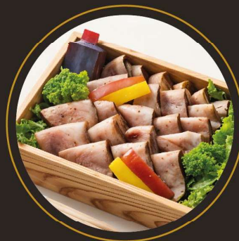
Hanagozen Bento 花御膳