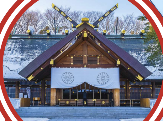
Hokkaido Shrine 北海道神宫