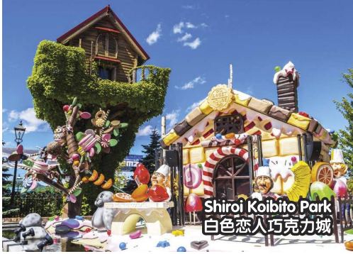
Shiroyo Koibito Park 白色恋人巧克力城