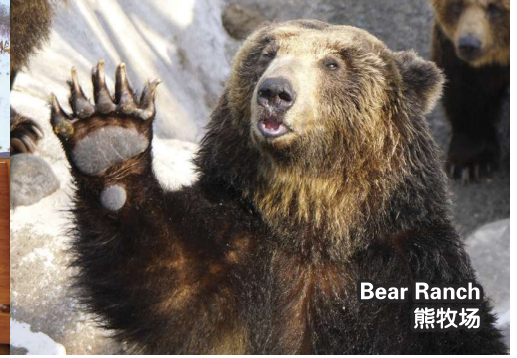
Bear Ranch 熊牧場