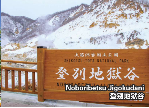
支笏洞爺国立公園 SHIKOTSU-TOYA NATIONAL PARK 登別地獄谷 Noboribetsu Jigokudani 登別地獄谷