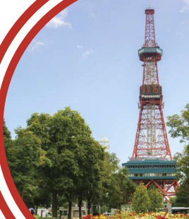
Odori Park 大通公园