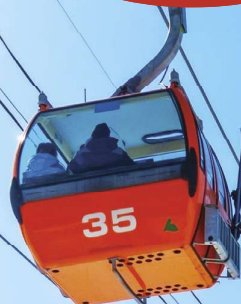
Sapporo Kokusai Ski 札幌国际滑雪场

行程次序，以當地旅社安排為準。 Sequences of Itinerary are subject to local arrangement.