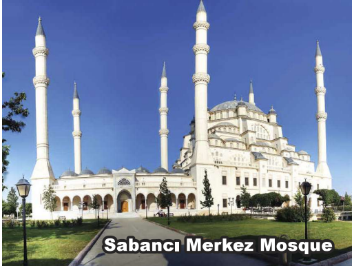
Sabancı Merkez Mosque