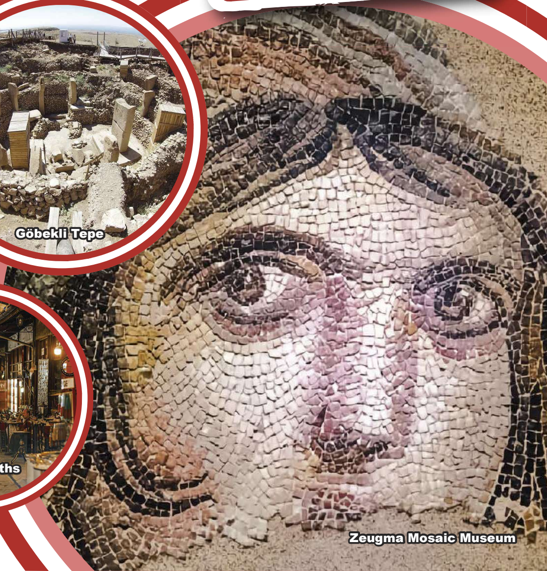
Zeugma Mosaic Museum