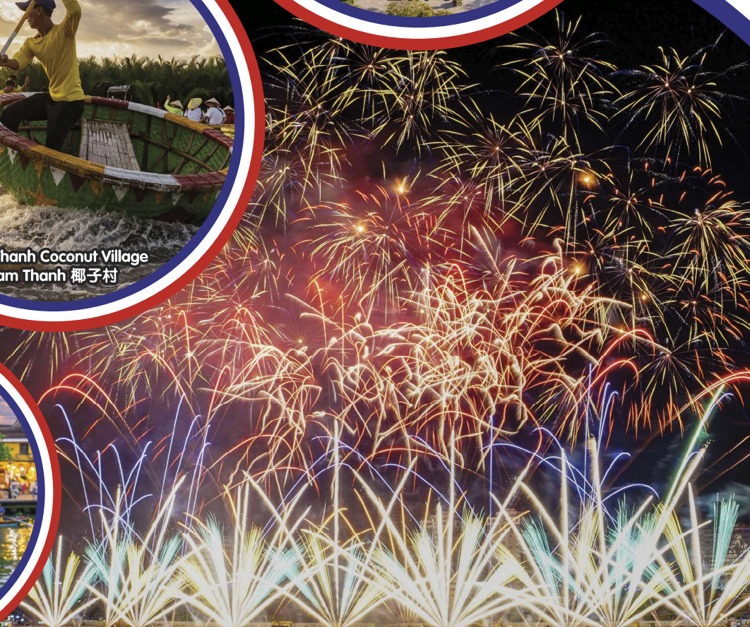
Danang International Fireworks Festival 岷港国际烟花节