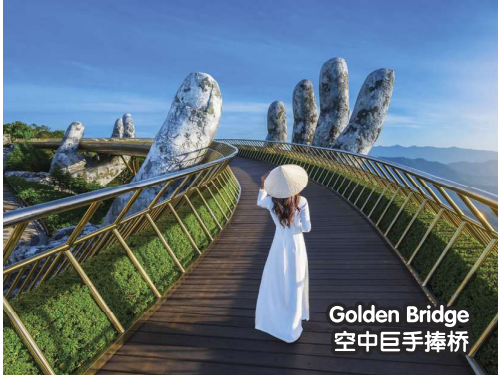
Golden Bridge 空中巨手捧桥