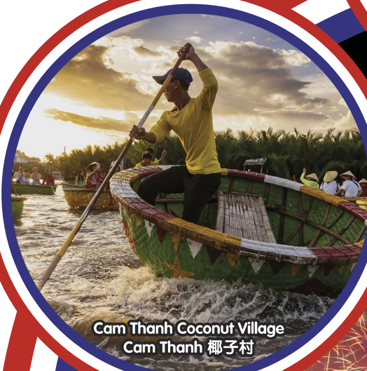
Cam Thanh Coconut Village Cam Thanh 椰子村