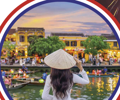
Hoi An Ancient Town 会安古城