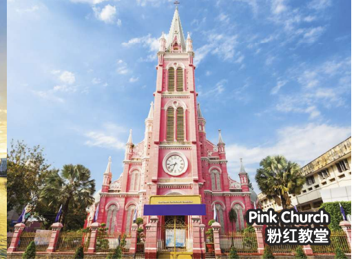
Pink Church 粉红教堂