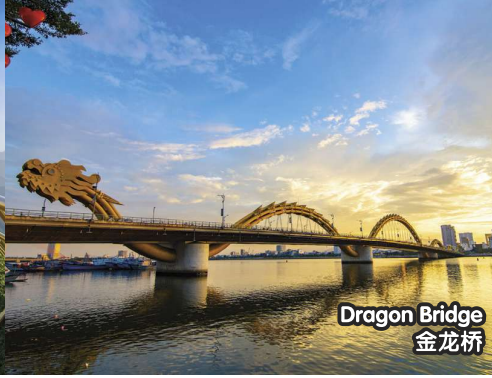
Dragon Bridge 金龙桥