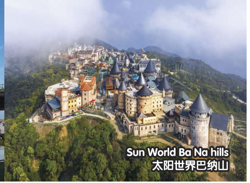
Sun World Ba Na hills 太阳世界巴纳山