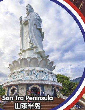
Son Tra Peninsula 山茶半岛