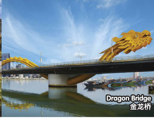
Dragon Bridge 金龙桥