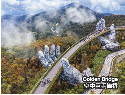
Golden Bridge 空中巨手捧桥