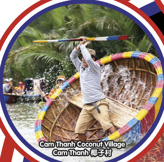
Cam Thanh Coconut Village Cam Thanh 椰子村