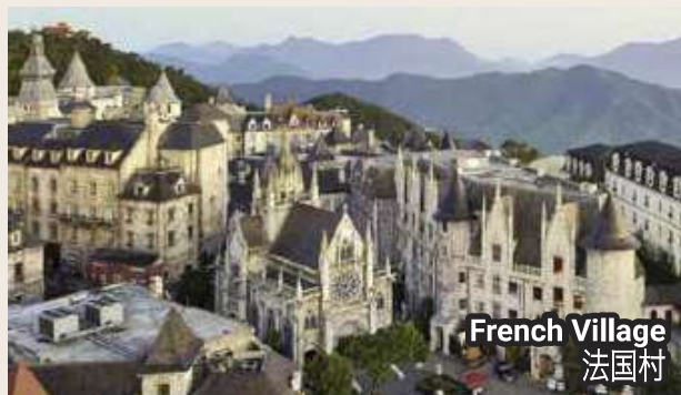
French Village 法国村