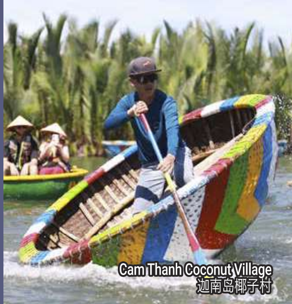
Cam Thanh Coconut Village 迦南岛椰子村