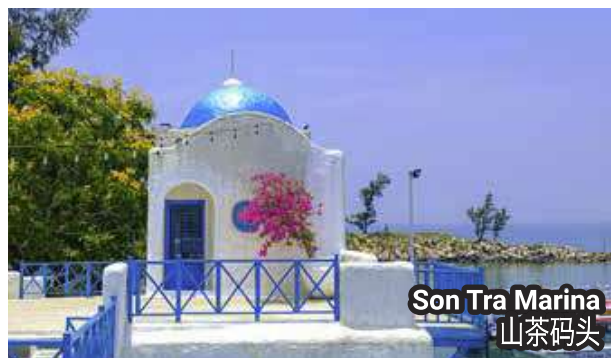
Son Tra Marina 山茶码头