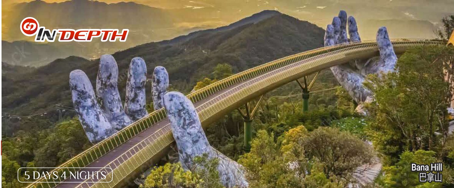
Bana Hill 巴拿山