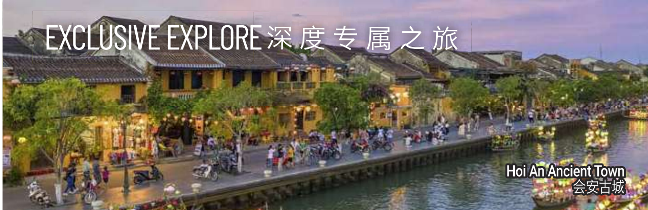
Hoi An Ancient Town 会安古城