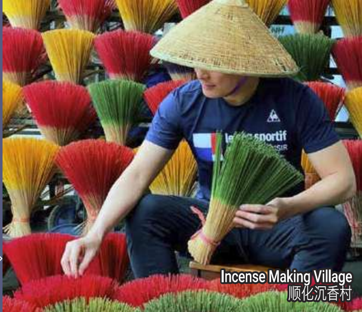
Incense Making Village 顺化沉香村