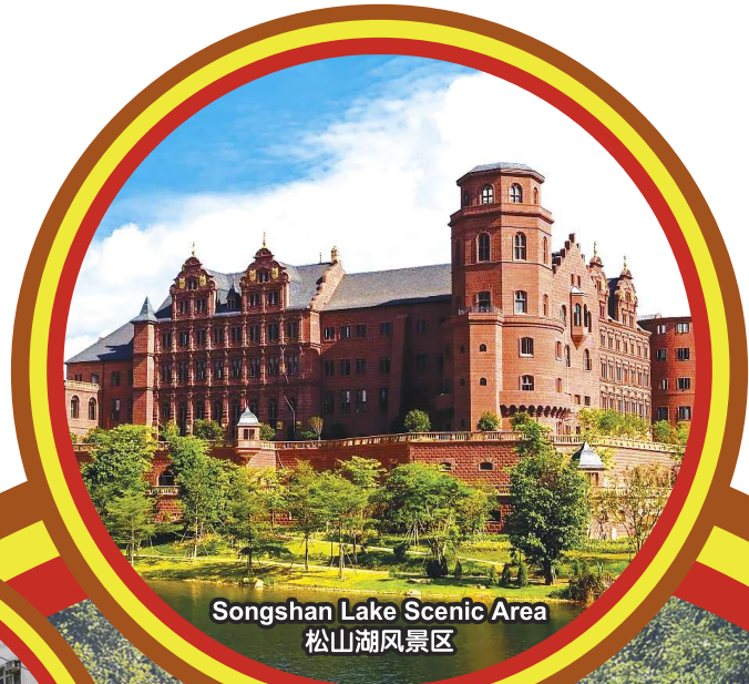
Songshan Lake Scenic Area 松山湖风景区