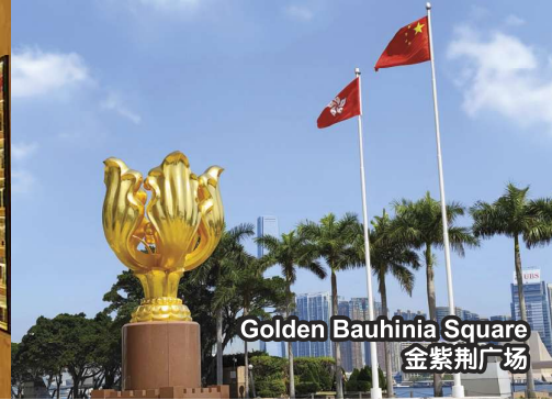
Golden Bauhinia Square 金紫荆广场