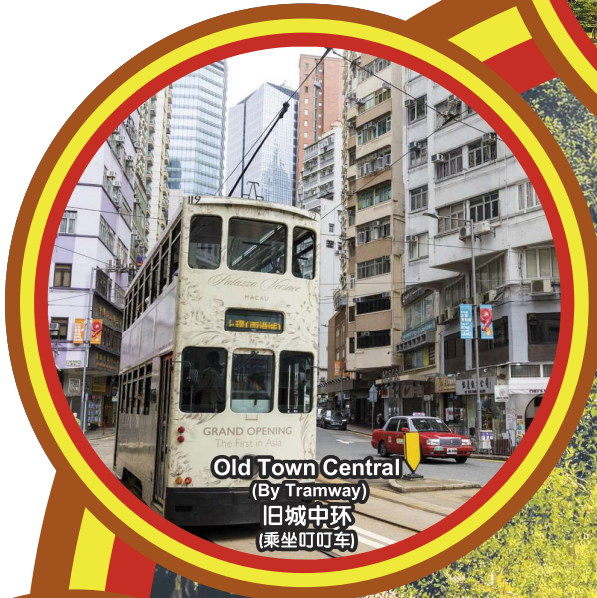
Old Town Central (By Tramway) 旧城中环 (乘坐叮叮车)