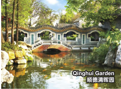
Qinghui Garden 顺德清晖园