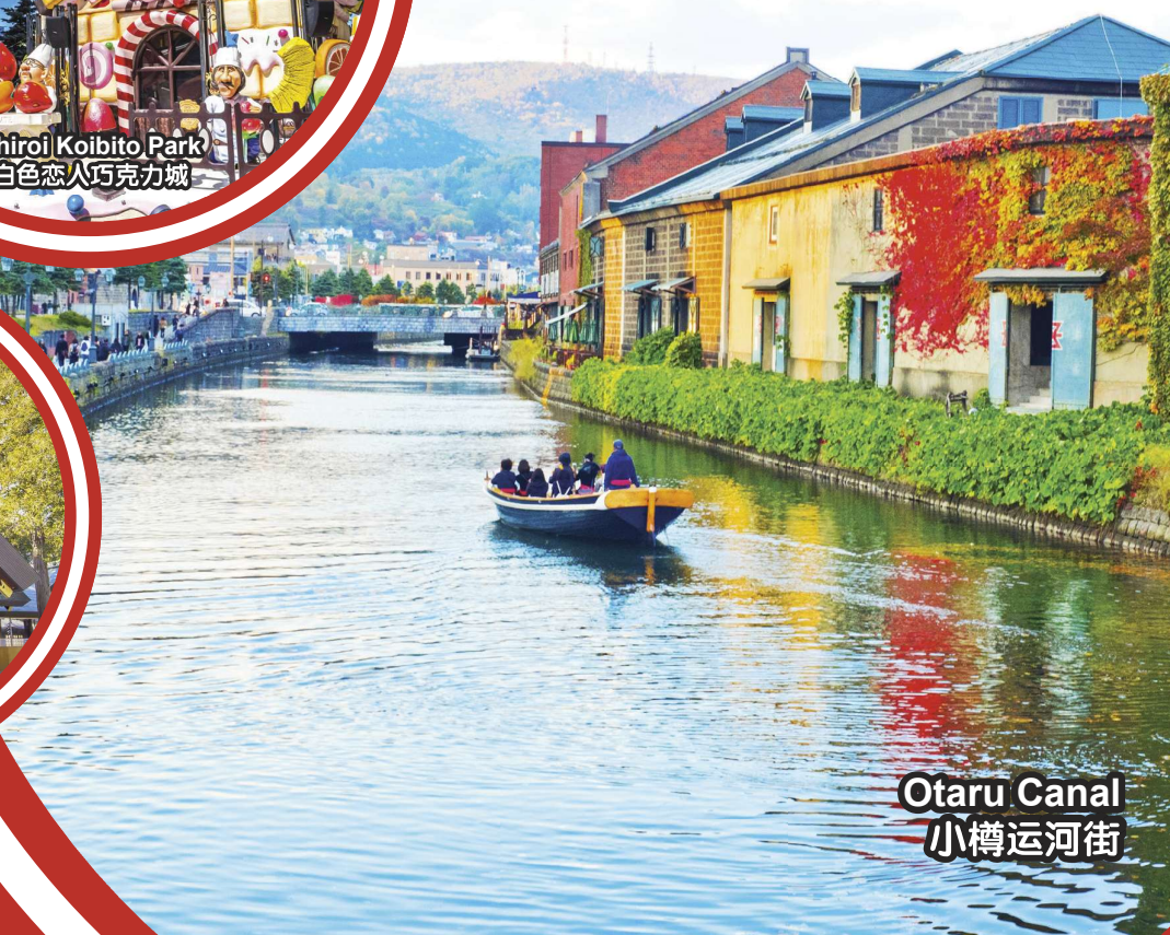
Otaru Canal 小樽运河街