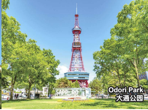
Odori Park 大通公園