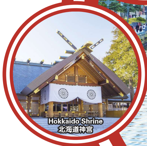
Hokkaido Shrine 北海道神社