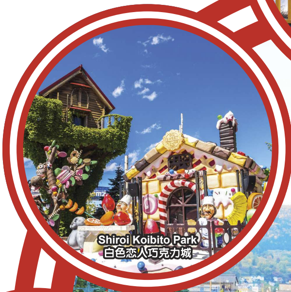
Shiroyoi Koibito Park 白色恋人巧克力城