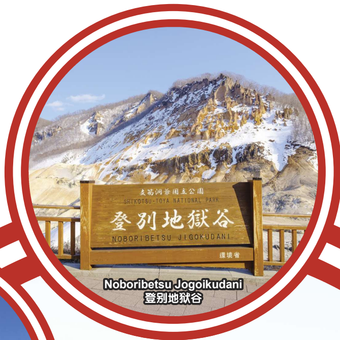
Noboribetsu Jogoikudani 登別地獄谷