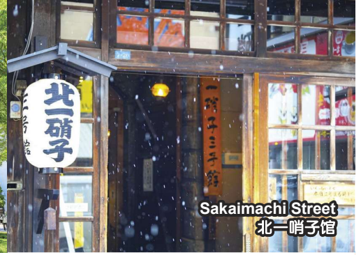
Sakaimachi Street 北一哨子街