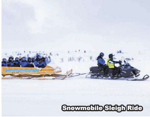
Snowmobile Sleigh Ride