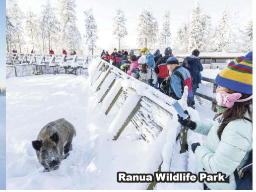
Ranua Wildlife Park