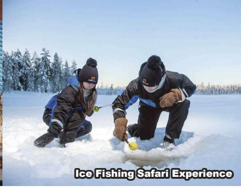
Ice Fishing Safari Experience