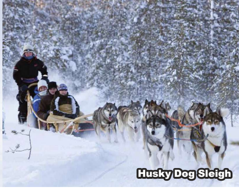
Husky Dog Sleigh