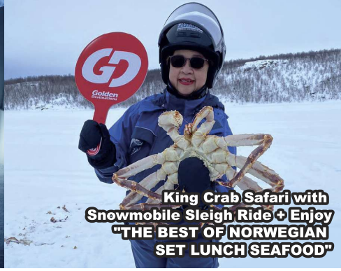
King Crab Safari with Snowmobile Sleigh Ride + Enjoy "THE BEST OF NORWEGIAN SET LUNCH SEAFOOD"