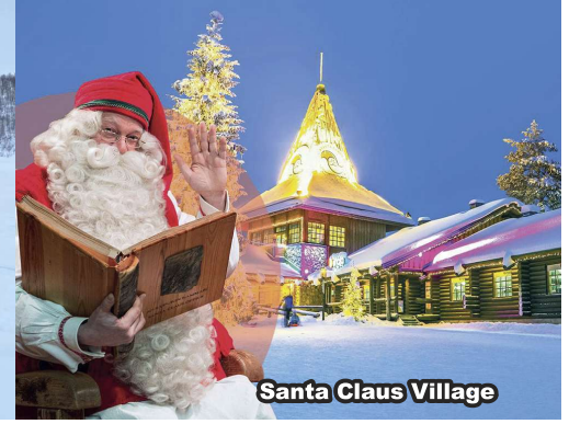
Santa Claus Village