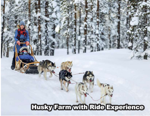
Husky Farm with Ride Experience