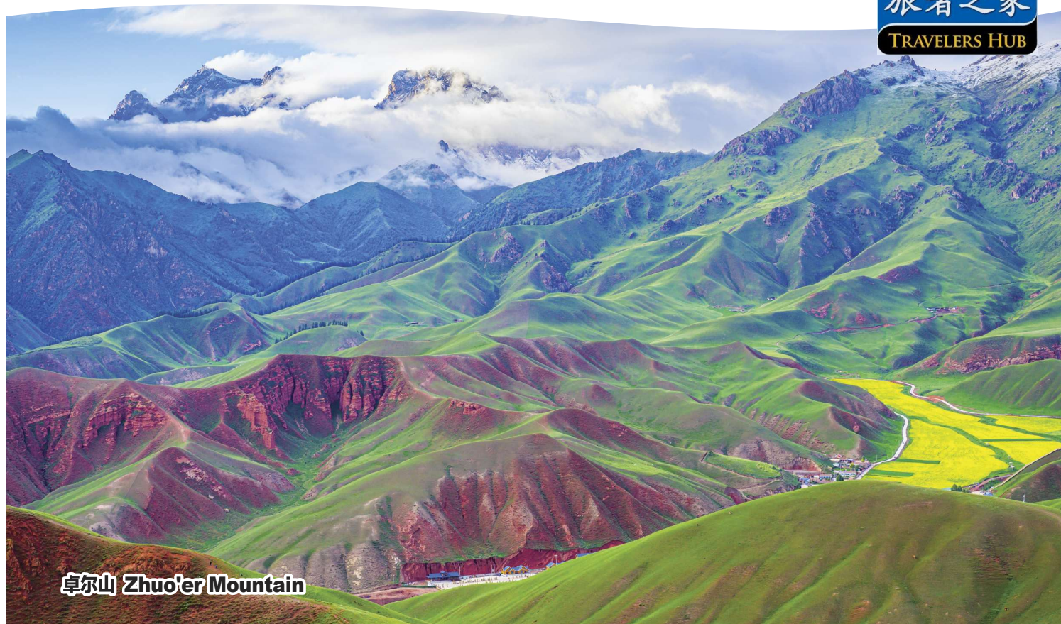
卓尔山 Zhuo'er Mountain