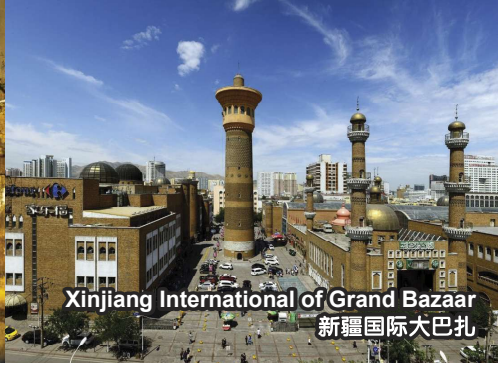
Xinjiang International of Grand Bazaar 新疆国际大巴扎