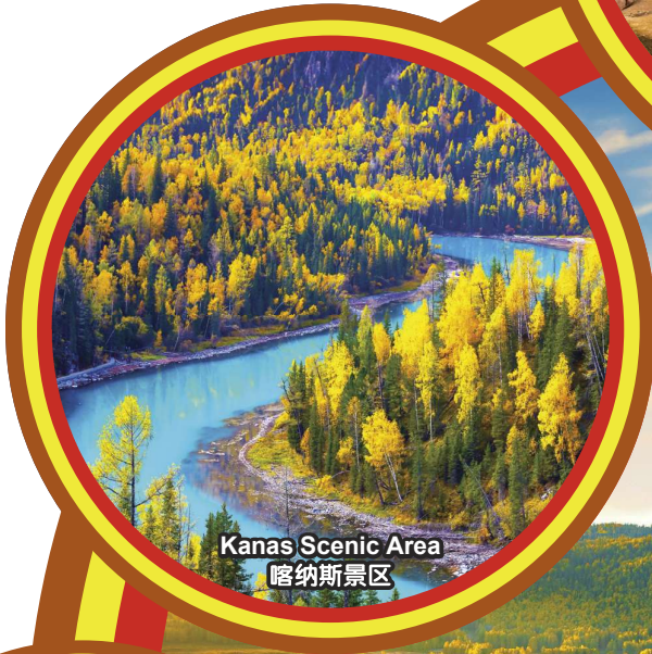
Kanas Scenic Area 喀纳斯景区