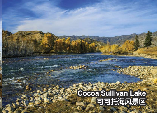
Cocoa Sullivan Lake 可可托海风景区