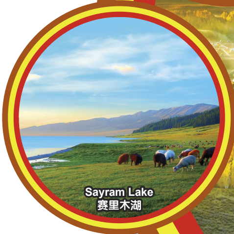
Sayram Lake 赛里木湖