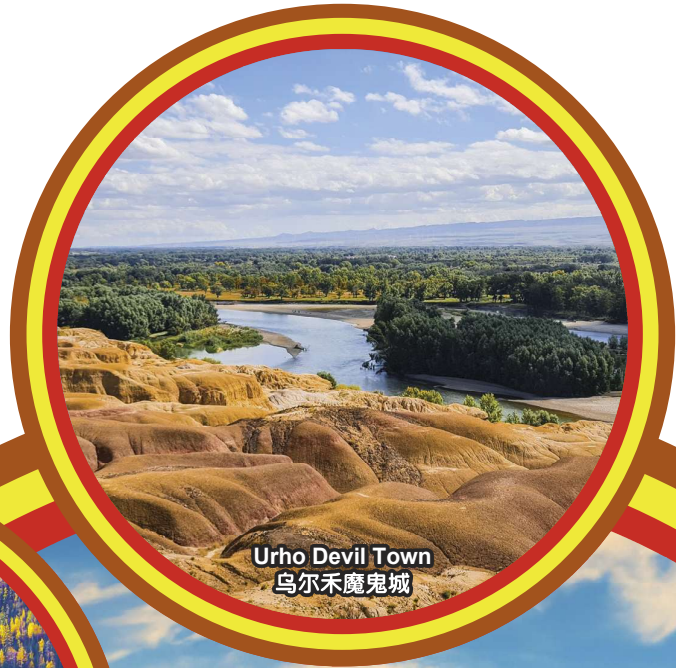
Urho Devil Town 乌尔禾魔鬼城