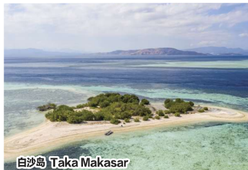
白沙岛 Taka Makasar