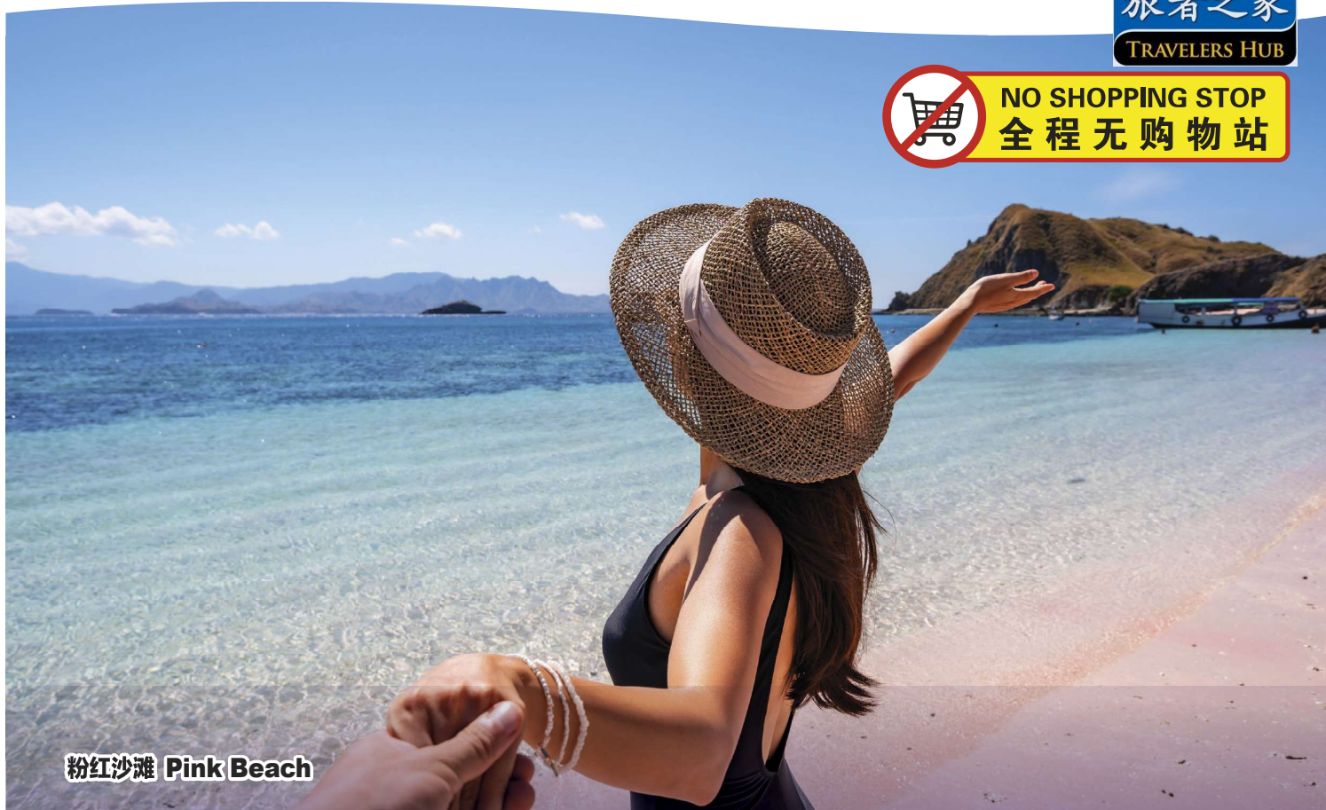
粉红沙滩 Pink Beach