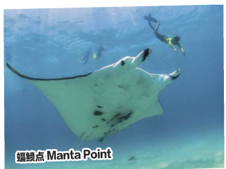
蝠鲼点 Manta Point