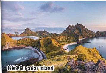
帕达尔岛 Padar Island