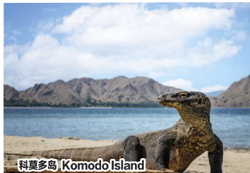
科莫多岛 Komodo Island