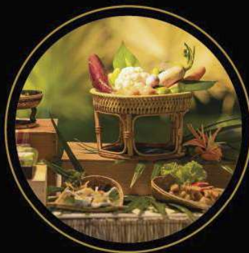
Cultural Night Dining 文化之夜晚宴