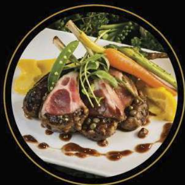
Khmer Cuisine 高棉风味餐