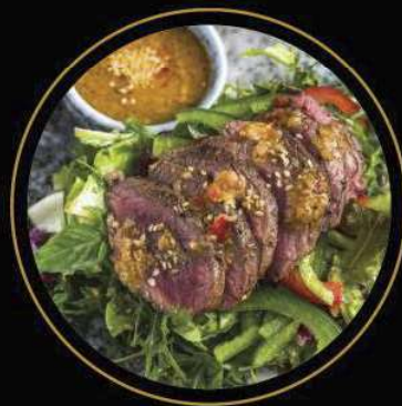
French Cuisine 法式风味餐