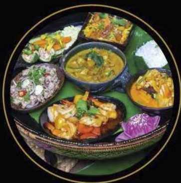
Asian Cuisine 亚洲风味餐