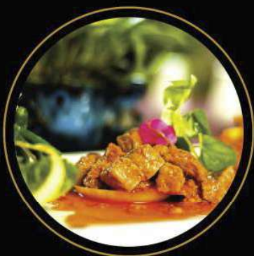
Khmer Cuisine 高棉风味餐