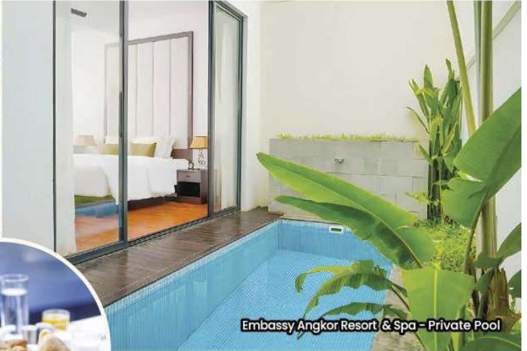
Embassy Angkor Resort & Spa – Private Pool