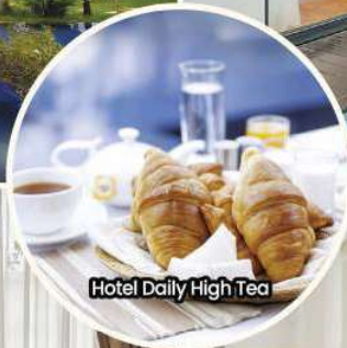
Hotel Daily High Tea