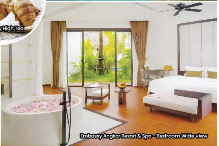
Embassy Angkor Resort & Spa – Bedroom Wide view