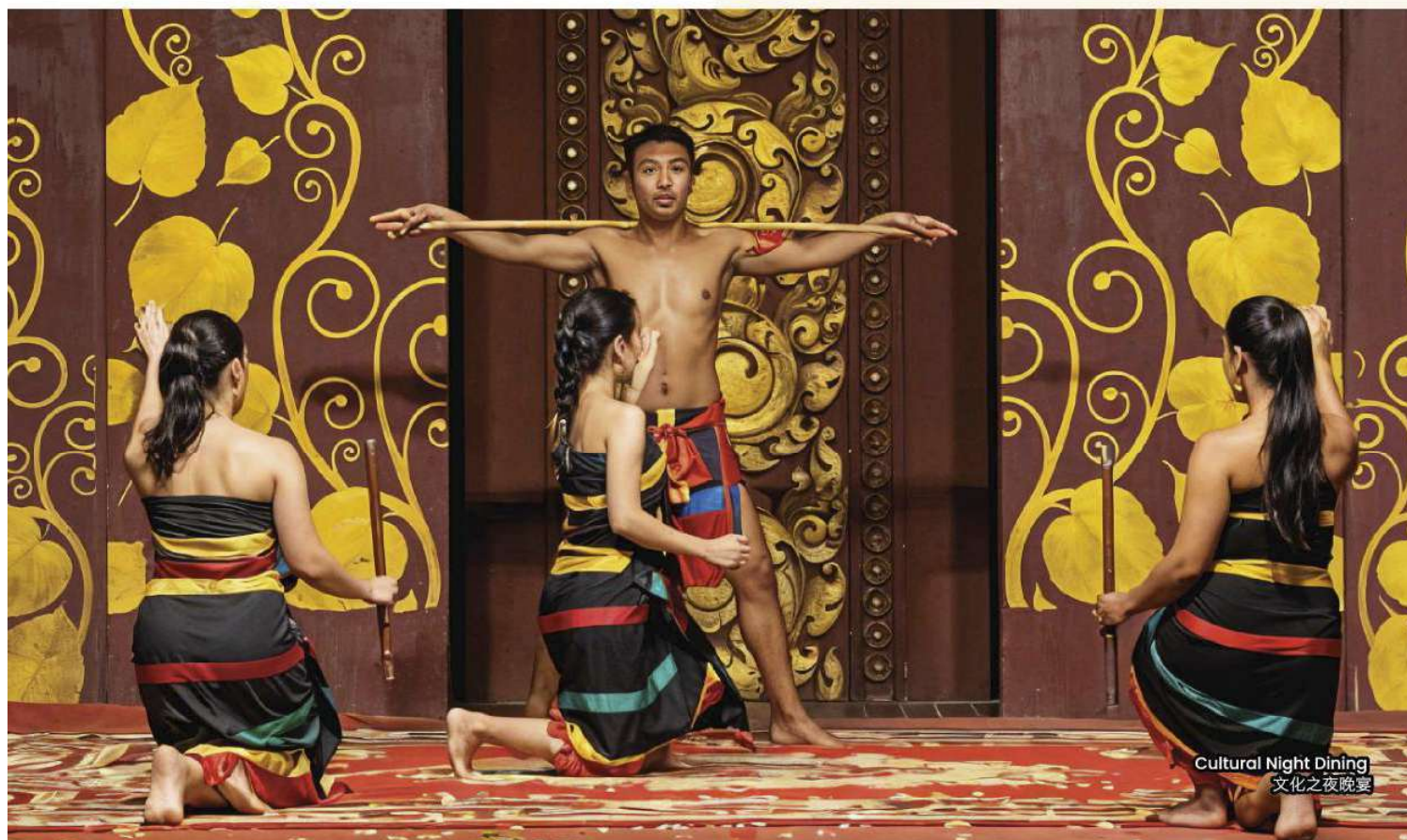
Cultural Night Dining 文化之夜晚宴

行程次序以当地旅行社安排为准。行程，膳食，住宿，交通等可能会因不可抗拒因素而更动，恕不另行通知。