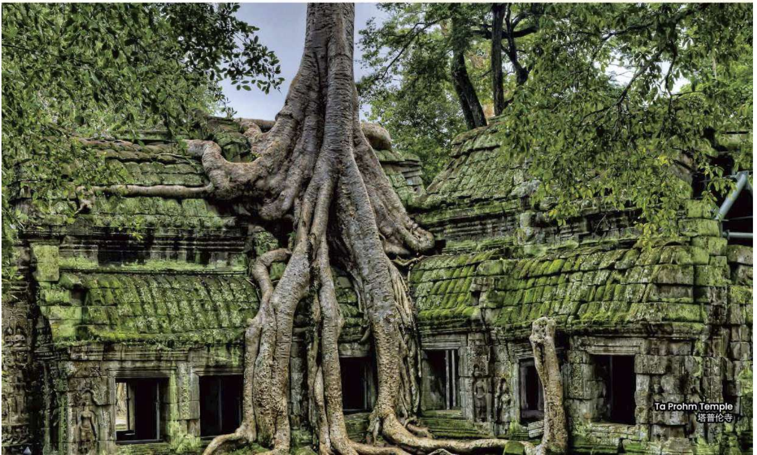
Ta Prohm Temple 塔普伦寺

Sequences of itinerary are subject to local arrangement. Itineraries, meals, hotels and transportation are subject to change without prior notice.