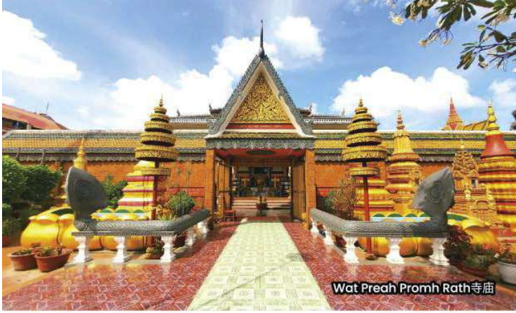
Wat Preah Promh Rath 寺庙