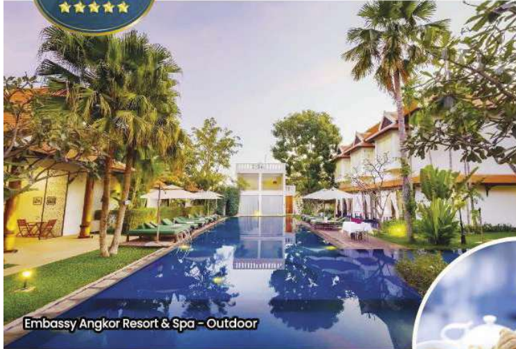
Embassy Angkor Resort & Spa – Outdoor

For this journey, we have arranged a 3-night stay at the same 5-star hotel with a suite featuring a private pool, ensuring greater convenience and relaxation for our guests. 此次行程特别安排了5 星级酒店连住3 晚，并提供带私人泳池的套房，让客人享受更便捷、轻松的住宿体验。