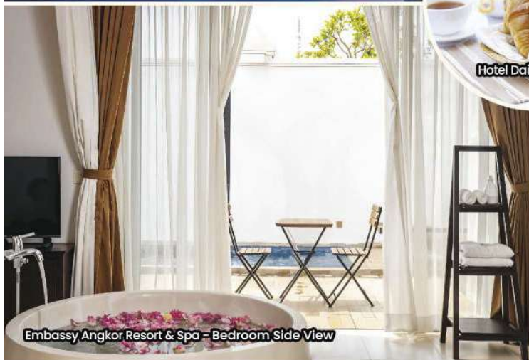
Embassy Angkor Resort & Spa – Bedroom Side View