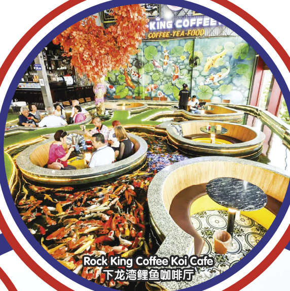
Rock King Coffee Koi Cafe 下龙湾鲤鱼咖啡厅