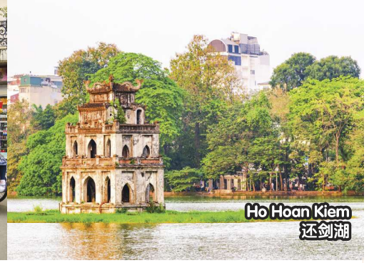
Ho Hoan Kiem 还剑湖