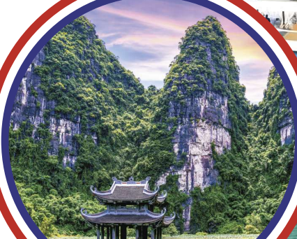
Trang An Grottoes 长安生态保护区