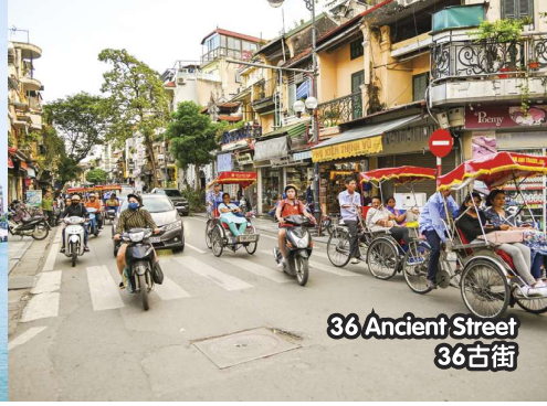
36 Ancient Street 36古街