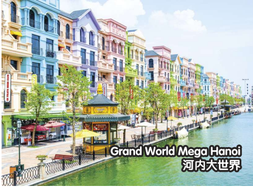
Grand World Mega Hanoi 河内大世界