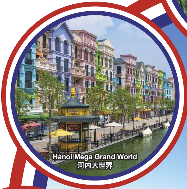
Hanoi Mega Grand World 河内大世界