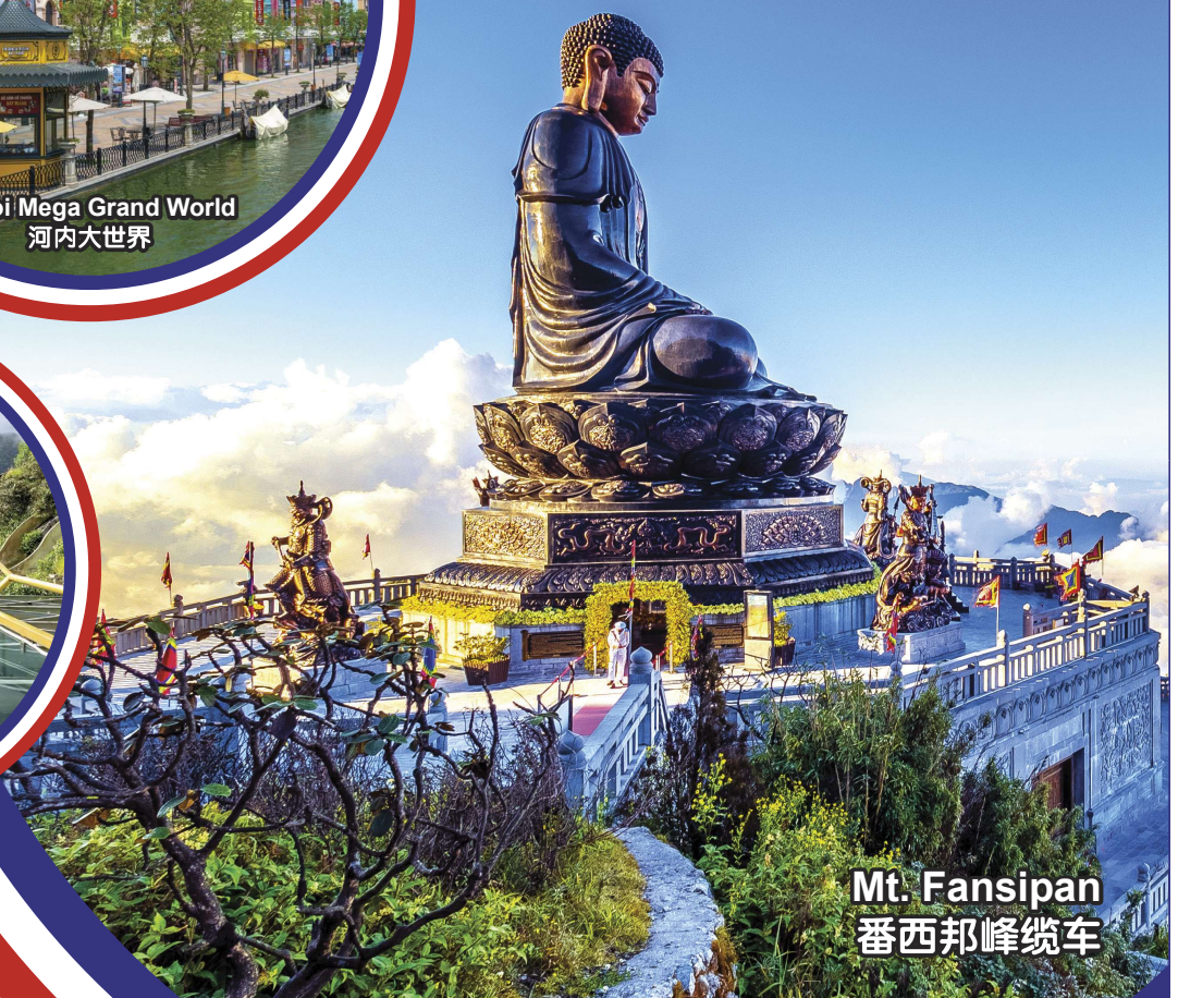
Mt. Fansipan 番西邦峰缆车

行程次序，以当地旅社安排为准。 Sequences of Itinerary are subject to local arrangement.