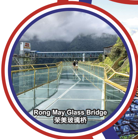
Rong May Glass Bridge 荣美玻璃桥