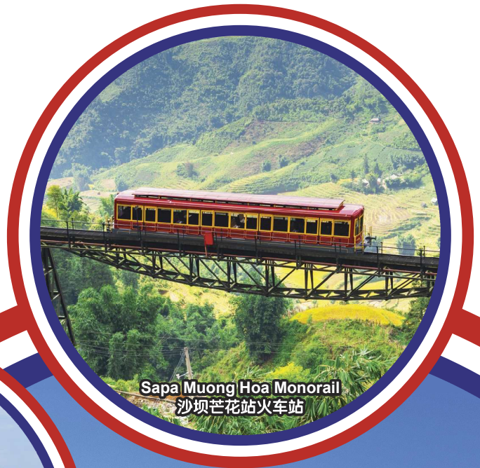
Sapa Muong Hoa Monorail 沙坝芒花站火车站