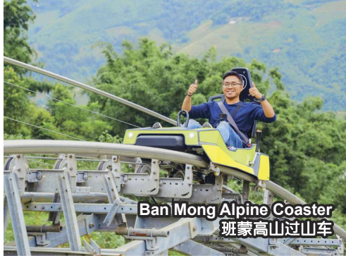
Ban Mong Alpine Coaster 班蒙高山过山车