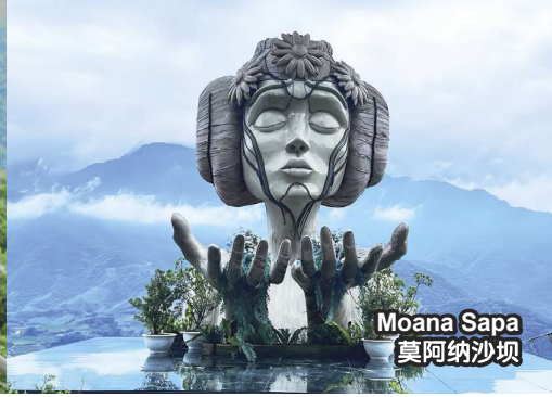
Moana Sapa 莫阿纳沙坝