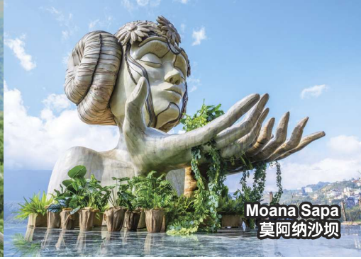
Moana Sapa 莫阿纳沙坝