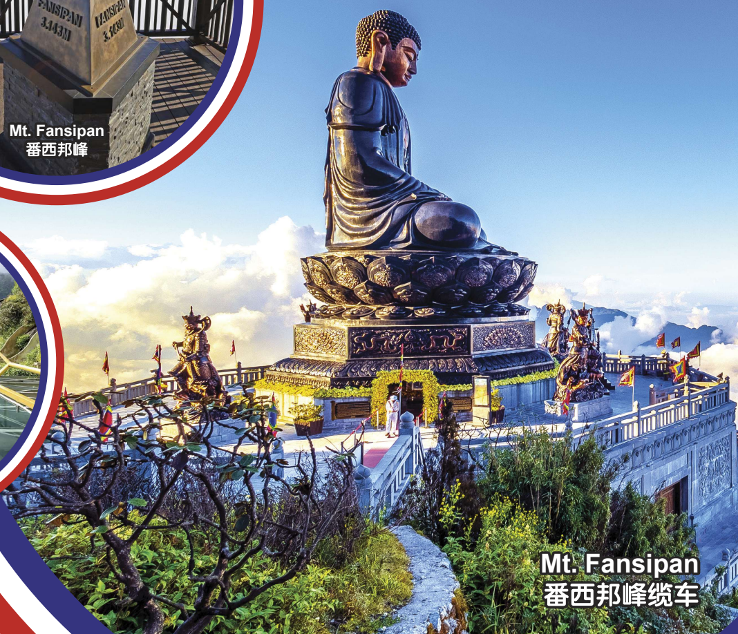
Mt. Fansipan 番西邦峰缆车

行程次序，以當地旅社安排為準。 Sequences of Itinerary are subject to local arrangement.