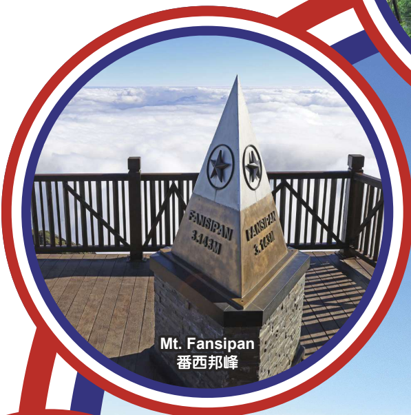
Mt. Fansipan 番西邦峰