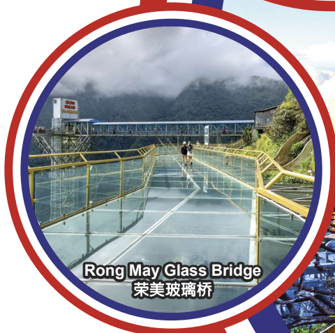
Rong May Glass Bridge 荣美玻璃桥

行程次序，以當地旅社安排為準。 Sequences of Itinerary are subject to local arrangement.