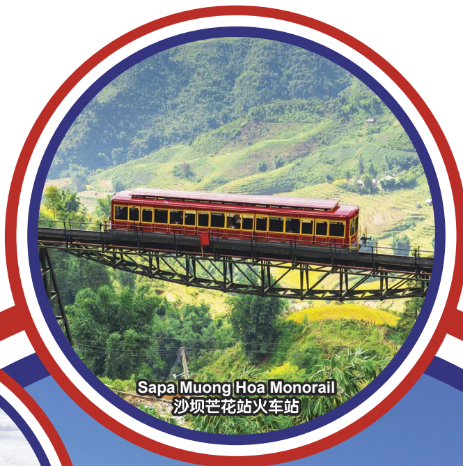
Sapa Muong Hoa Monorail 沙坝芒花站火车站