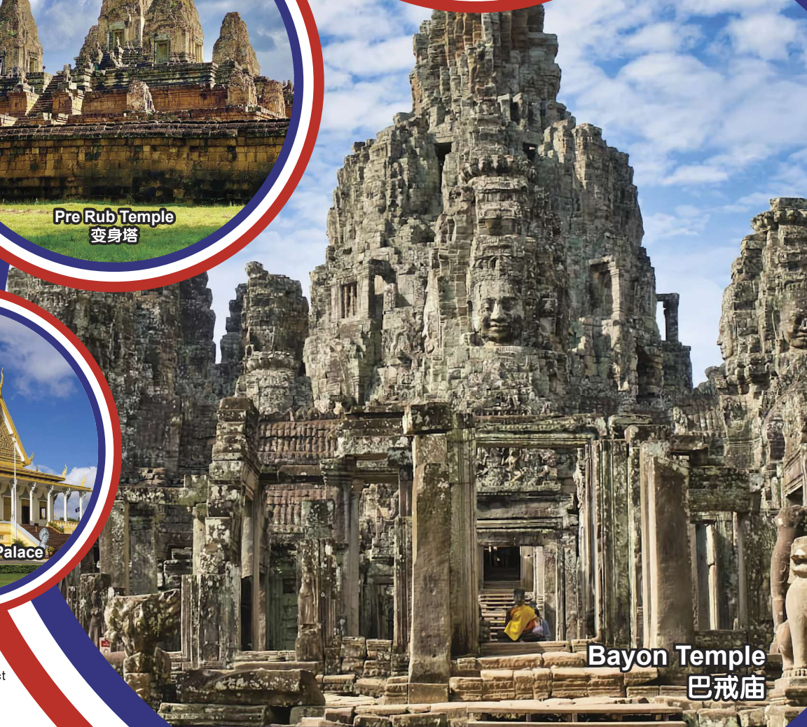
Bayon Temple 巴戒庙