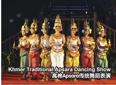
Khmer Traditional Apsara Dancing Show 高棉Apsara传统舞蹈表演