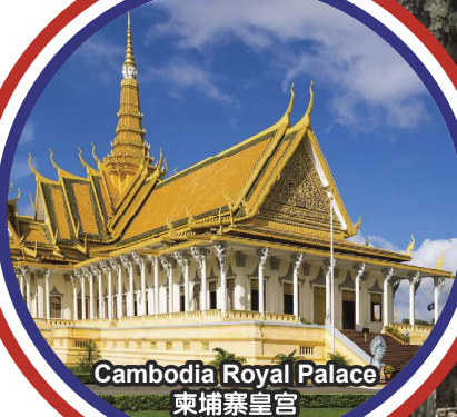
Cambodia Royal Palace 柬埔寨皇宫