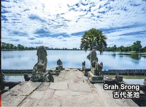
Srah Srong 古代圣池