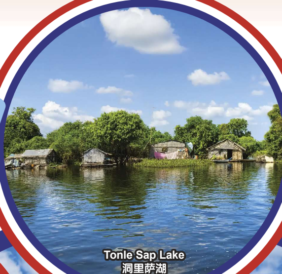
Tonle Sap Lake 洞里萨湖