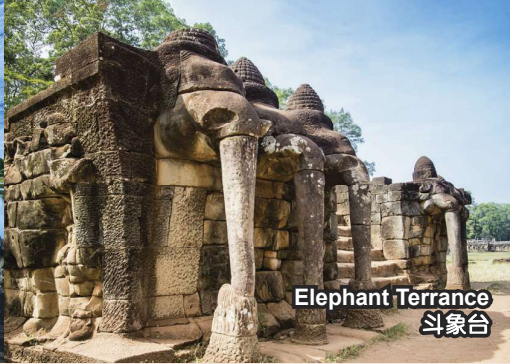
Elephant Terrace 斗象台