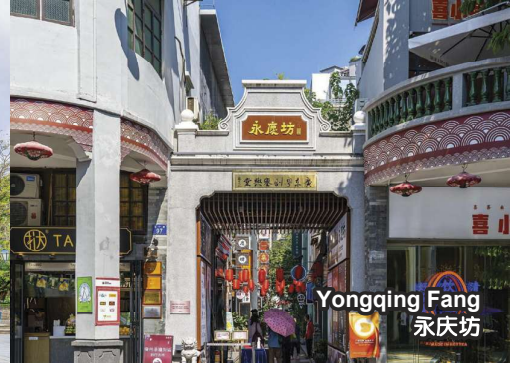
Yongqing Fang 永庆坊