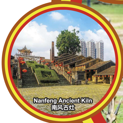
Nanfeng Ancient Kiln 南风古灶