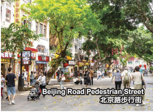
Beijing Road Pedestrian Street 北京路步行街