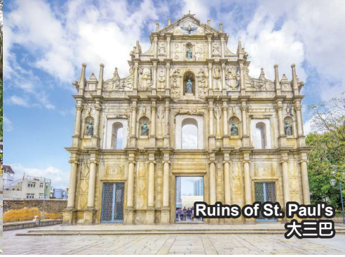
Ruins of St. Paul's 大三巴