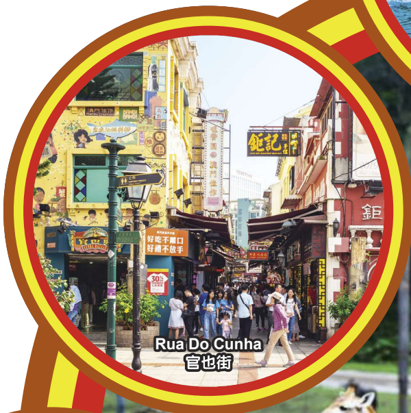
Rua Do Cunha 官也街