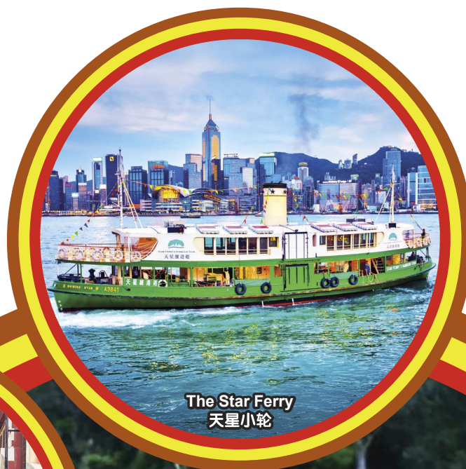
The Star Ferry 天星小轮