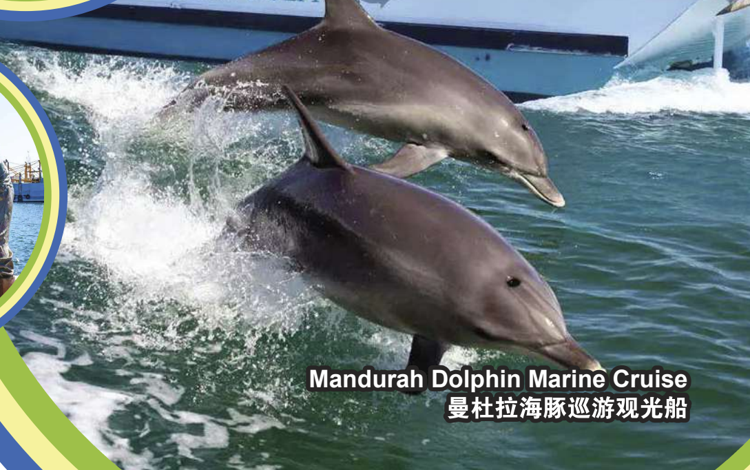
Mandurah Dolphin Marine Cruise 曼杜拉海豚巡游观光船

行程次序，以当地旅社安排为准。 Sequences of Itinerary are subject to local arrangement.