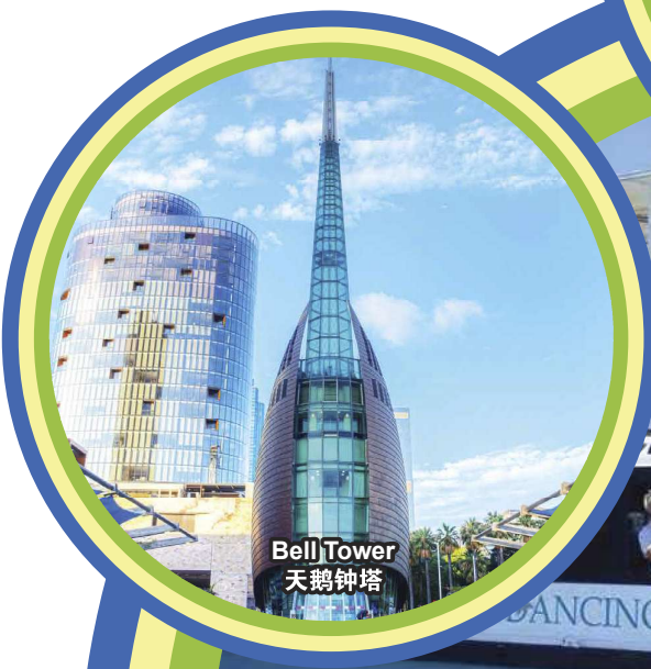
Bell Tower 天鹅钟塔