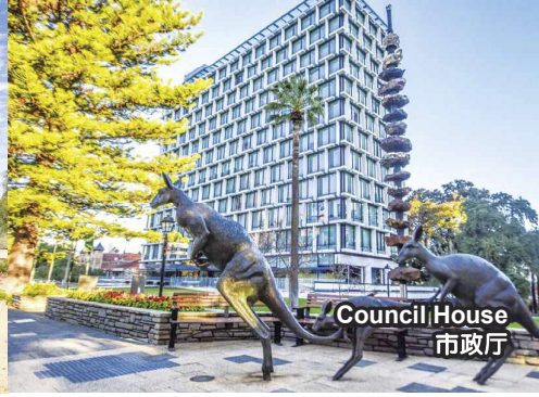
Council House 市政厅