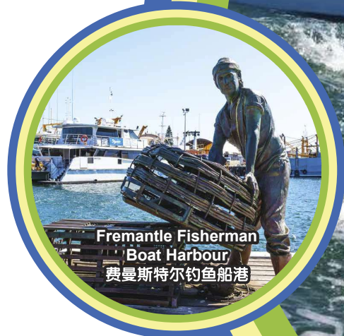
Fremantle Fisherman Boat Harbour 费曼斯特尔钓鱼船港