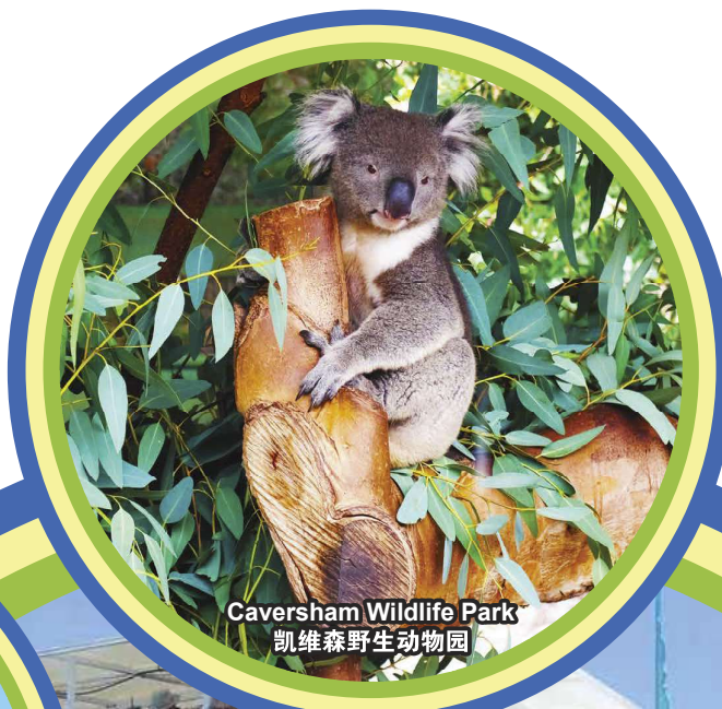
Caversham Wildlife Park 凯维森野生动物园