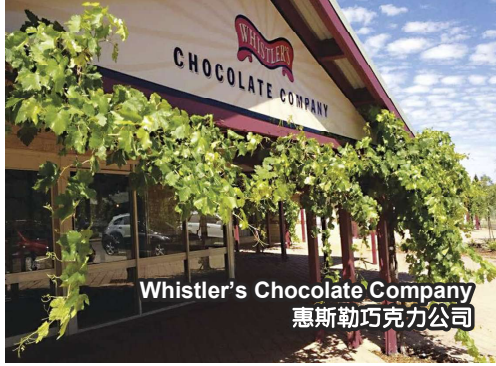
Whistler's Chocolate Company 惠斯勒巧克力公司