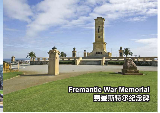
Fremantle War Memorial 费曼斯特尔纪念碑