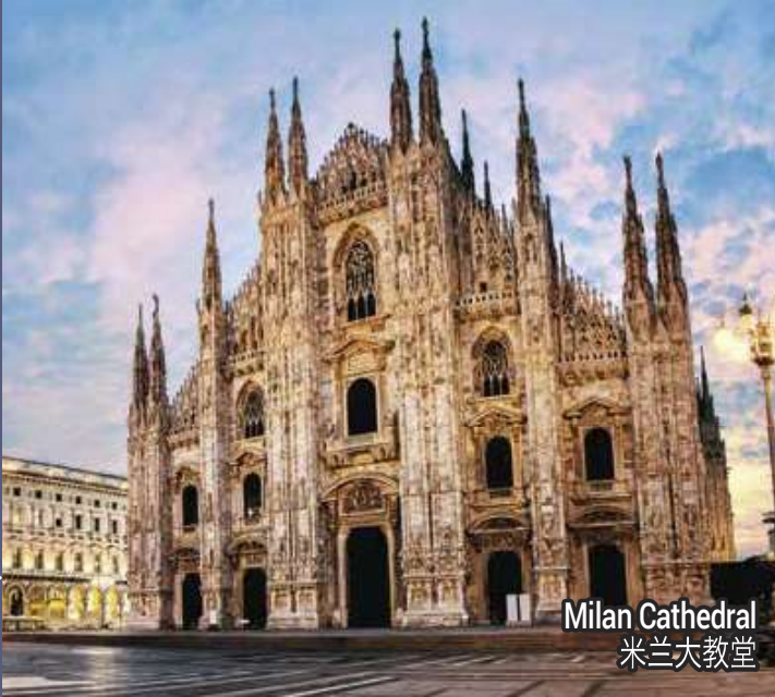
Milan Cathedral 米兰大教堂