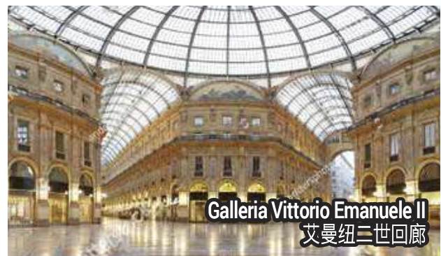
Galleria Vittorio Emanuele II 艾曼纽二世回廊