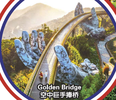
Golden Bridge 空中巨手捧桥