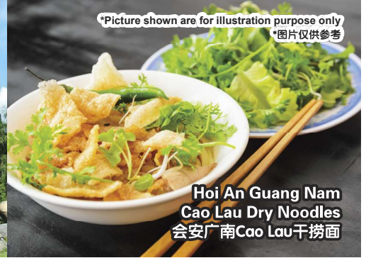
Hoi An Quang Nam Cao Lau Dry Noodles 会安广南Cao Lau干捞面

*Picture shown are for illustration purpose only *图片仅供参考