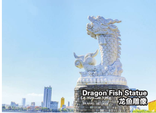
Dragon Fish Statue 龙鱼雕像 Da Nang - Vietnam