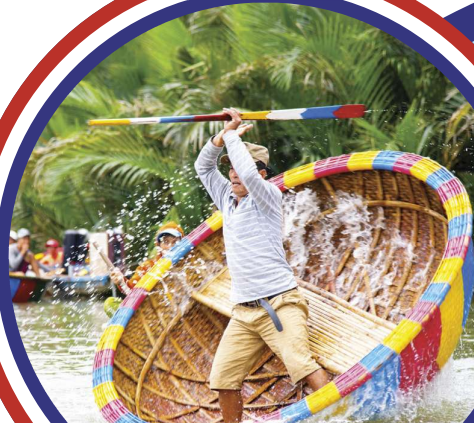
Cam Thanh Coconut Village Cam Thanh 椰子村