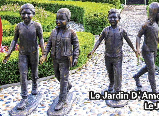
Le Jardin D'Amour Flower Garden Le Jardin D'Amour 花园

行程次序, 以当地旅社安排为准。 Sequences of Itinerary are subject to local arrangement.