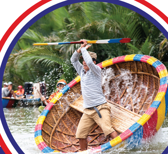
Cam Thanh Coconut Village Cam Thanh 椰子村