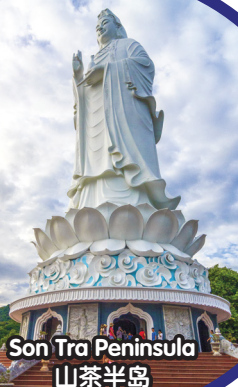
Son Tra Peninsula 山茶半岛