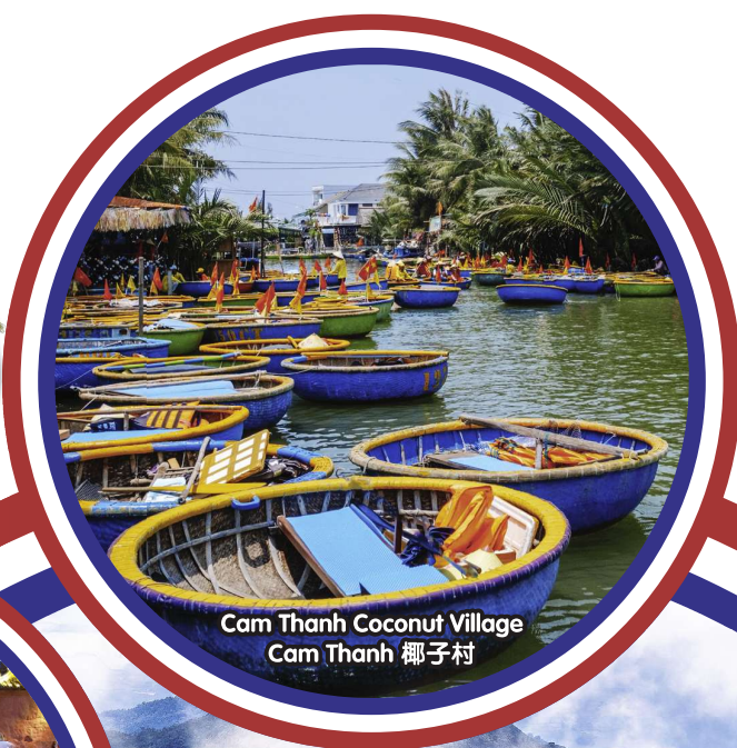
Cam Thanh Coconut Village Cam Thanh 椰子村