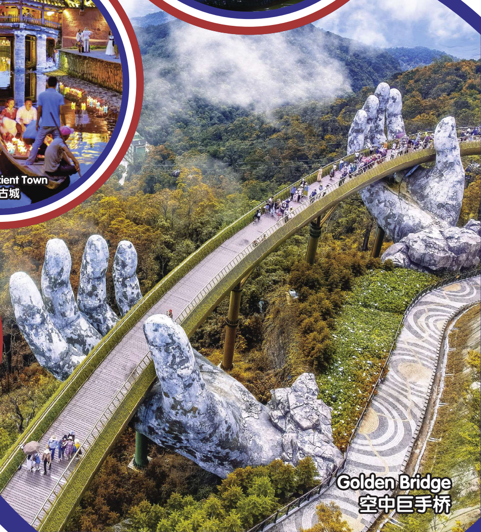
Golden Bridge 空中巨手桥