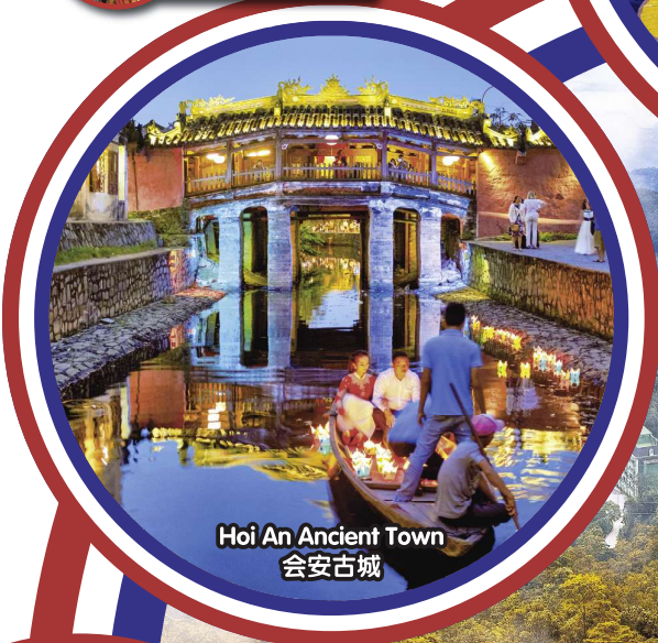
Hoi An Ancient Town 会安古城