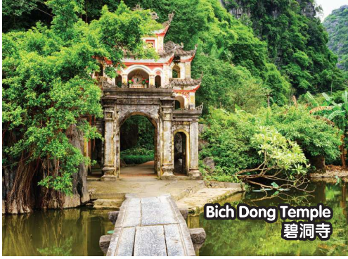
Bich Dong Temple 碧洞寺