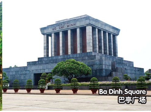
Ba Dinh Square 巴亭广场