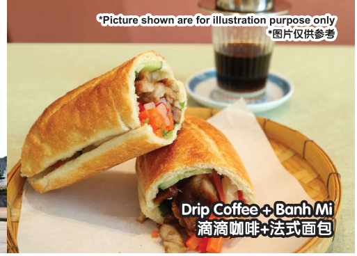
Drip Coffee + Banh Mi 滴滴咖啡+法式面包