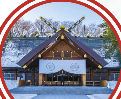
Hokkaido Shrine 北海道神宮