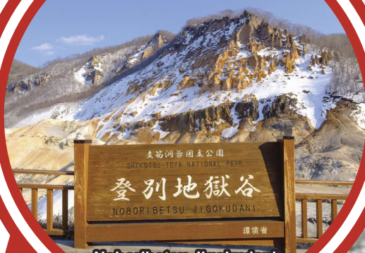
Noboribetsu Jigokudani 登別地獄谷