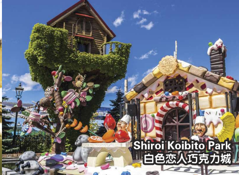
Shiroyo Koibito Park 白色恋人巧克力城