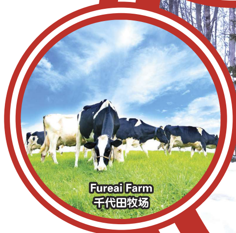
Fureai Farm 千代田牧场