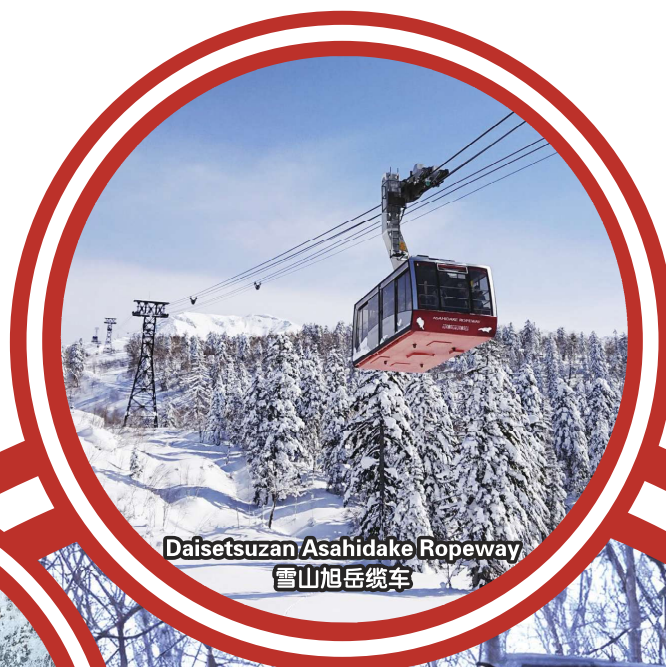
Daisetsuzan Asahidake Ropeway 雪山旭岳缆车