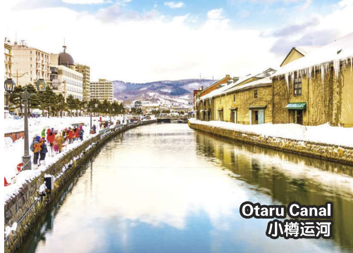
Otaru Canal 小樽运河