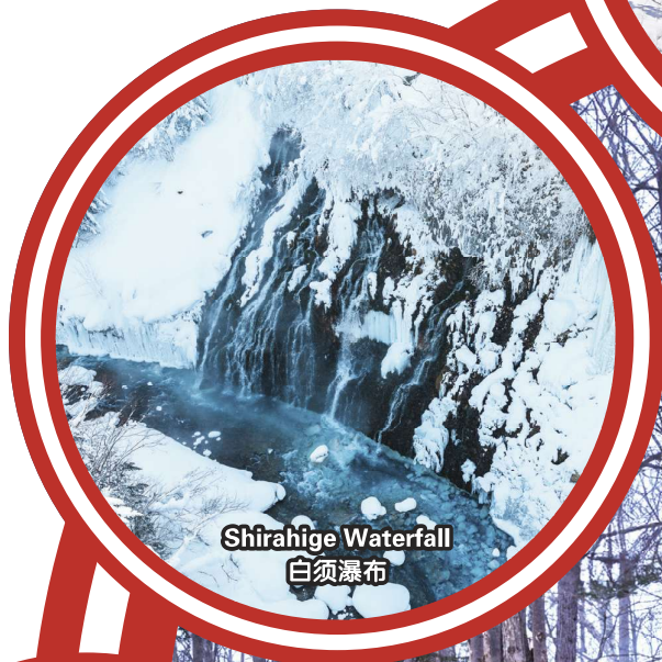
Shirahige Waterfall 白须瀑布