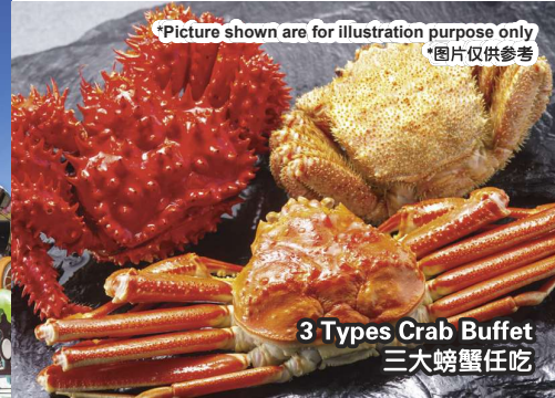
3 Types Crab Buffet 三大螃蟹任吃