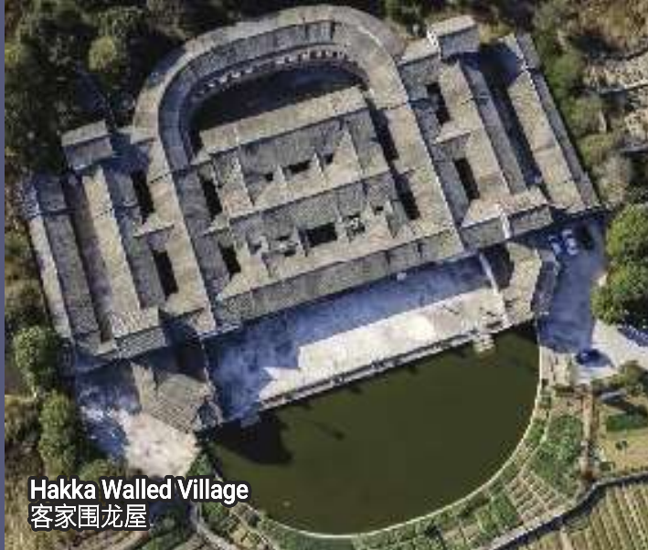
Hakka Walled Village 客家围龙屋