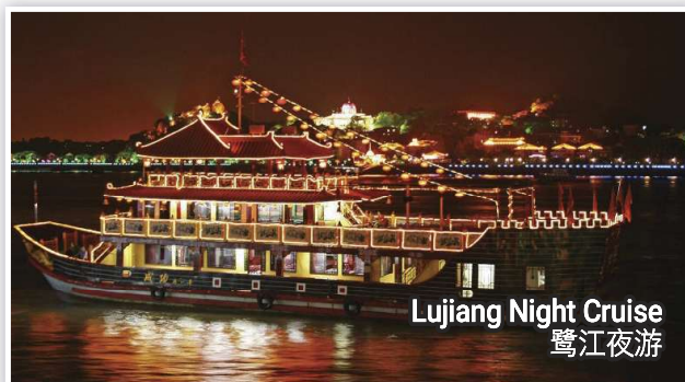
Lujiang Night Cruise 鹭江夜游