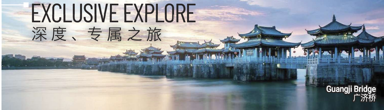
Guangji Bridge 广济桥