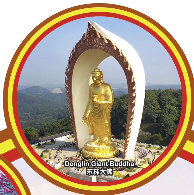
Donglin Giant Buddha 东林大佛