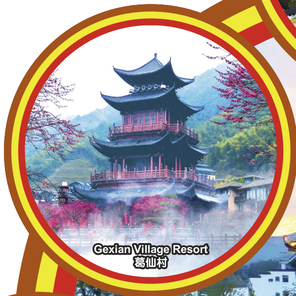
Gexian Village Resort 葛仙村