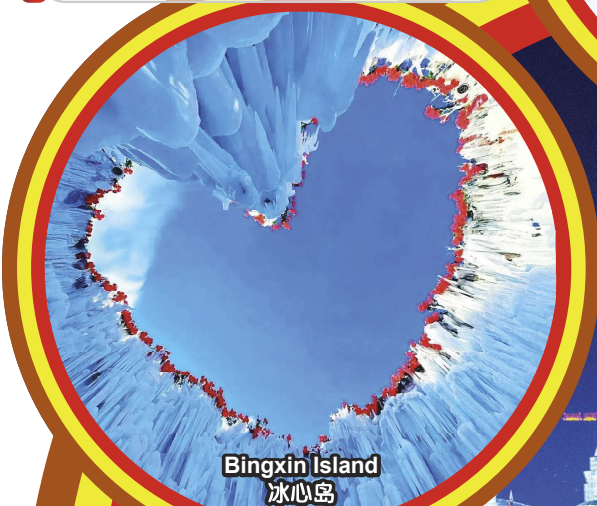
Bingxin Island 冰心岛