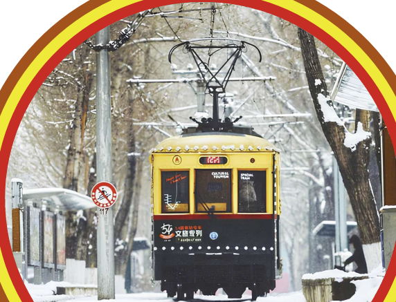
Changchun Retro Tram 长春号复古电车