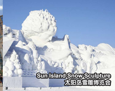
Sun Island Snow Sculpture 太阳岛雪雕博览会