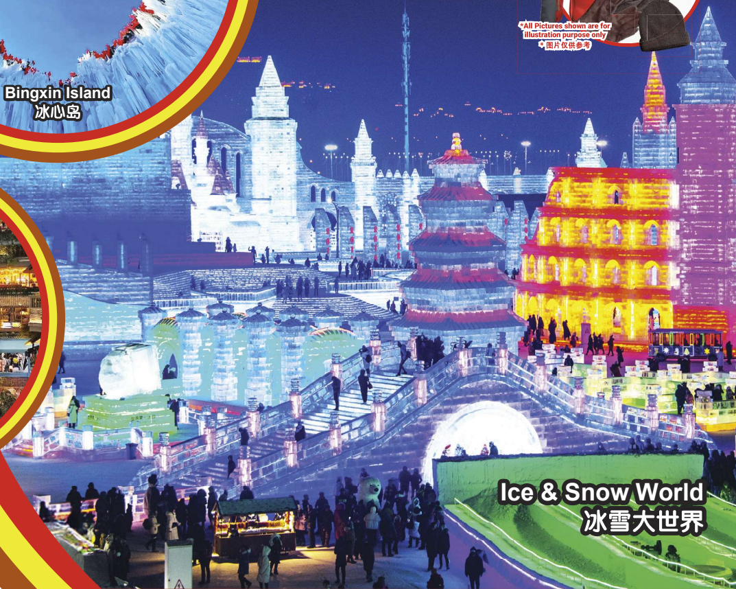
Ice & Snow World 冰雪大世界

行程次序，以当地旅社安排为准。 Sequences of Itinerary are subject to local arrangement.