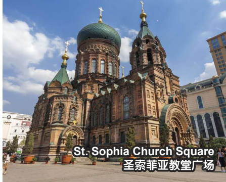
St. Sophia Church Square 圣索菲亚教堂广场